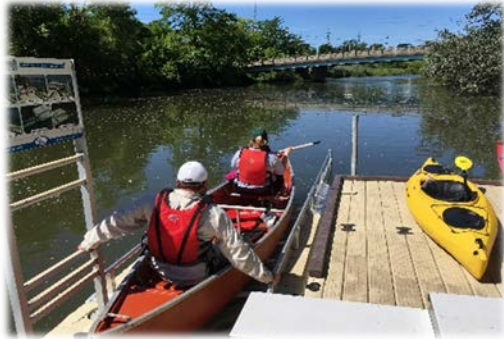
Michigan City ADA-approved Canoe and Kayak Launch

The Indiana Lake Michigan Coastal Program (LMCP), in partnership with the National Oceanic and Atmospheric Administration, provides a complete suite of services to coastal partners including: coordination, financial, and technical assistance. This assistance augments state and local capacity to address current and future resource management issues. Through its interconnected program components, the LMCP links partners with a larger network of technical assistance at the state and national level.