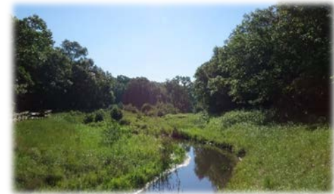
Dunes Creek Daylighting

The LMCP supports conservation by providing technical and financial assistance to communities and nonprofit organizations seeking to acquire land and effectively restore and manage natural resources.