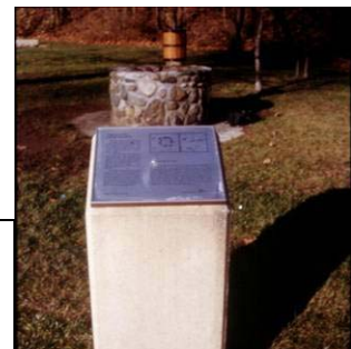
Assessing current conditions of fort locations was part of the process. Marker commemorating the second Fort Wayne.