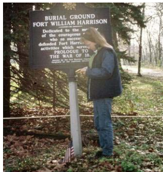
DHPA staff member using GPS technology to record a location related to Fort Harrison in Vigo County.

A critical component of this type of project is the actual fieldwork. The DHPA staff investigated each of their assigned locations during the project. Field investigations consisted of physically locating the relevant sites and recording them through GPS (Global Positioning System) technology, mapping, and photography. This type of documentation is critical in determining the current physical integrity of the sites, their state of preservation, any potential threats to the properties, and their potential eligibility to the Indiana Register of Historic Sites and Structures and the National Register of Historic Sites and Structures. At several of the Indiana properties in the project, archaeological and other types of investigations and studies have taken place in the past.