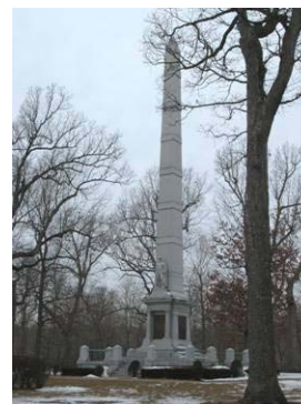
The Tippecanoe Battlefield in Indiana is so significant that it is a National Historic Landmark.

Several staff from the Archaeology and Survey and Registration sections of the DHPA attended extensive training sessions (covering required documentation levels and techniques, GPS [global positioning system] techniques, and more) held by the National Park Service in Vincennes, Indiana for a week in 2001, and then began the actual work to complete the surveys. Compared to some other states also in the project, Indiana had relatively few sites to record, but this research, fieldwork, and documentation (combined with the training) to meet the American Battlefield Protection Program’s standards, took many months to complete.