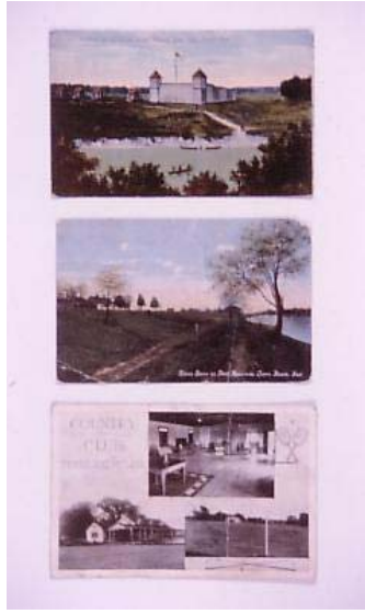
Historic postcards showing various views of one of the fort and battlefield sites recorded during the project.

Extensive research was completed for each of the Indiana sites which had been chosen. The researchers drew upon records and primary sources available at the state level, and particularly at the local level. Contacts were made with, for example, local historical societies, libraries, local governmental offices (such as surveyors) and landowners, with the goal of finding as much information as possible for the individual historic properties. Items such as historic (and modern) maps, books, land ownership records, photographs, postcards, archaeological records, State and National Register documents and more were reviewed. Information gleaned from these types of sources provided the researchers with valuable documentation to combine with the field research and investigations.