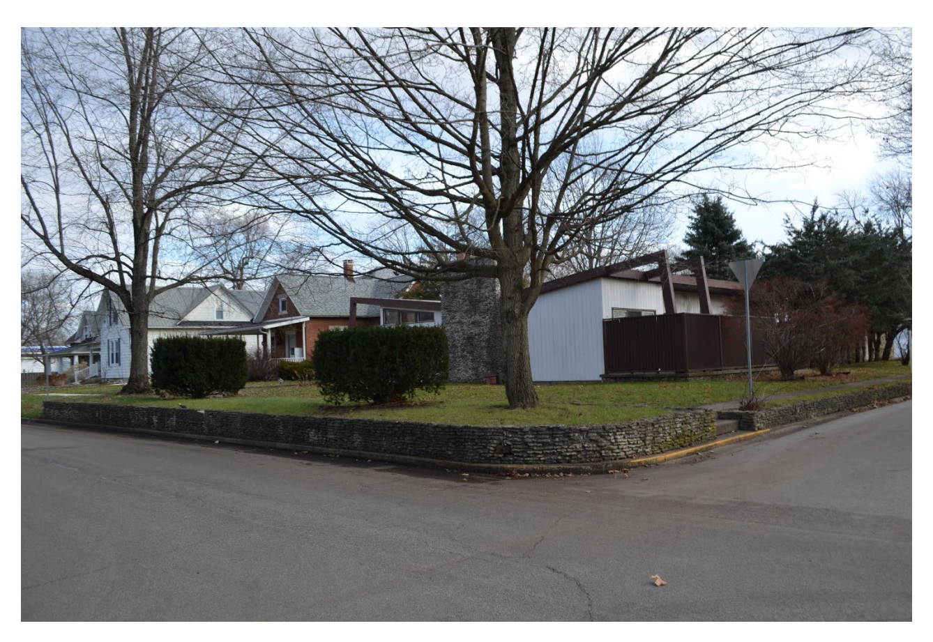
IN\_Carroll County\_South Delphi Historic District\_0021