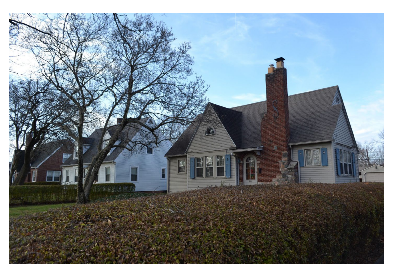
IN\_Carroll County\_South Delphi Historic District\_0015