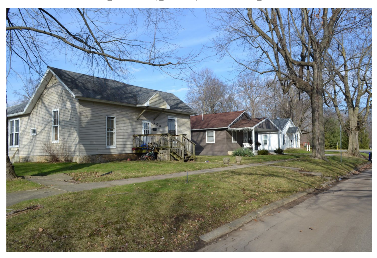
IN\_Carroll County\_South Delphi Historic District\_0018