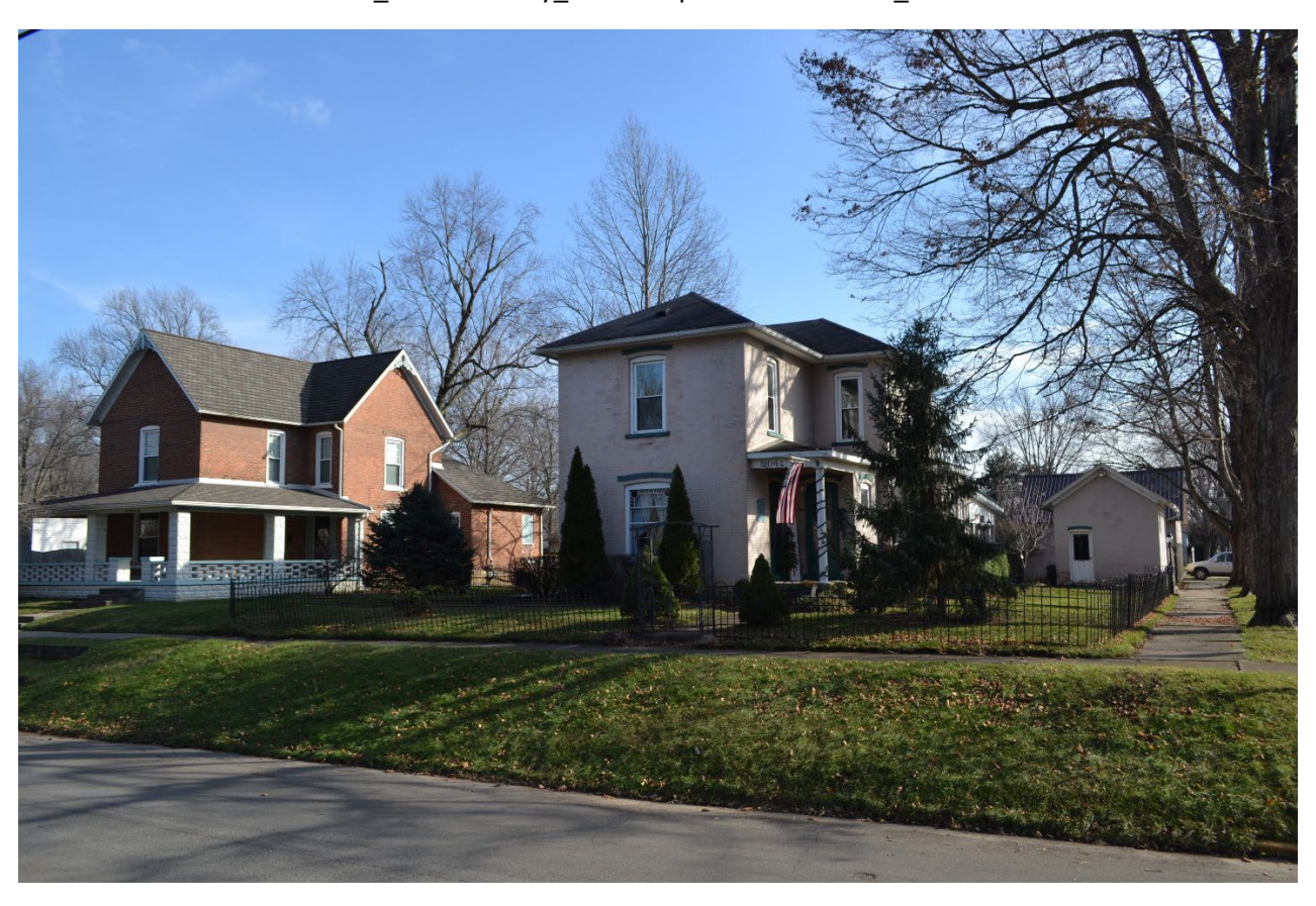
IN\_Carroll County\_South Delphi Historic District\_0008