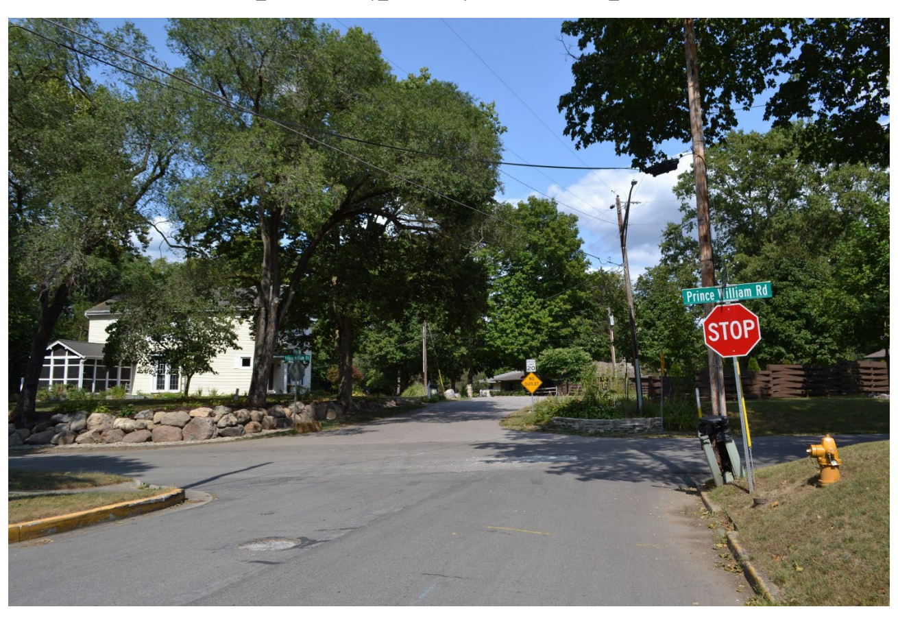
IN\_Carroll County\_South Delphi Historic District\_0024