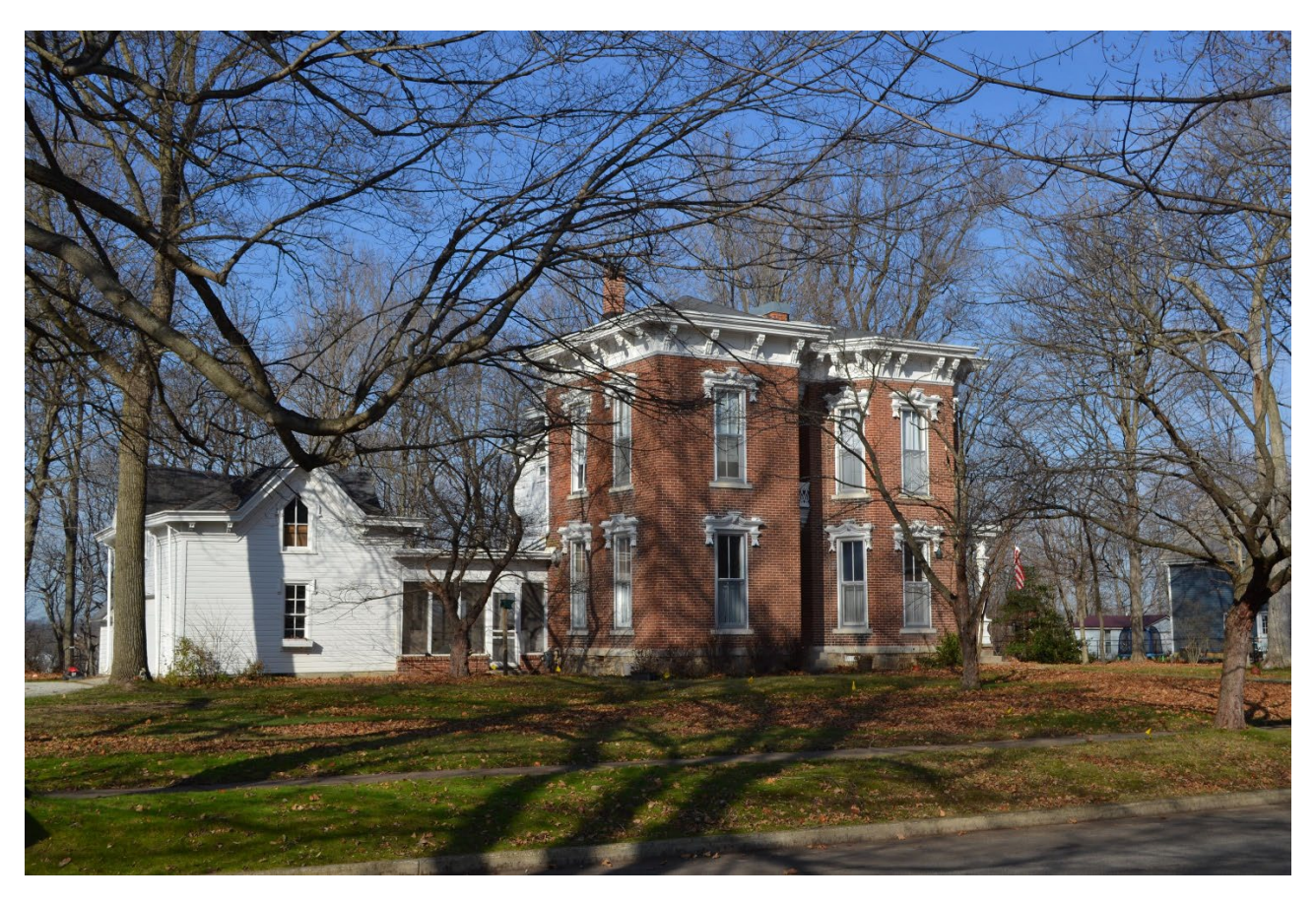
IN\_Carroll County\_South Delphi Historic District\_0002