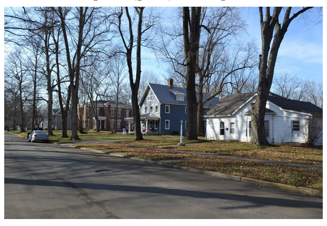
IN\_Carroll County\_South Delphi Historic District\_0003