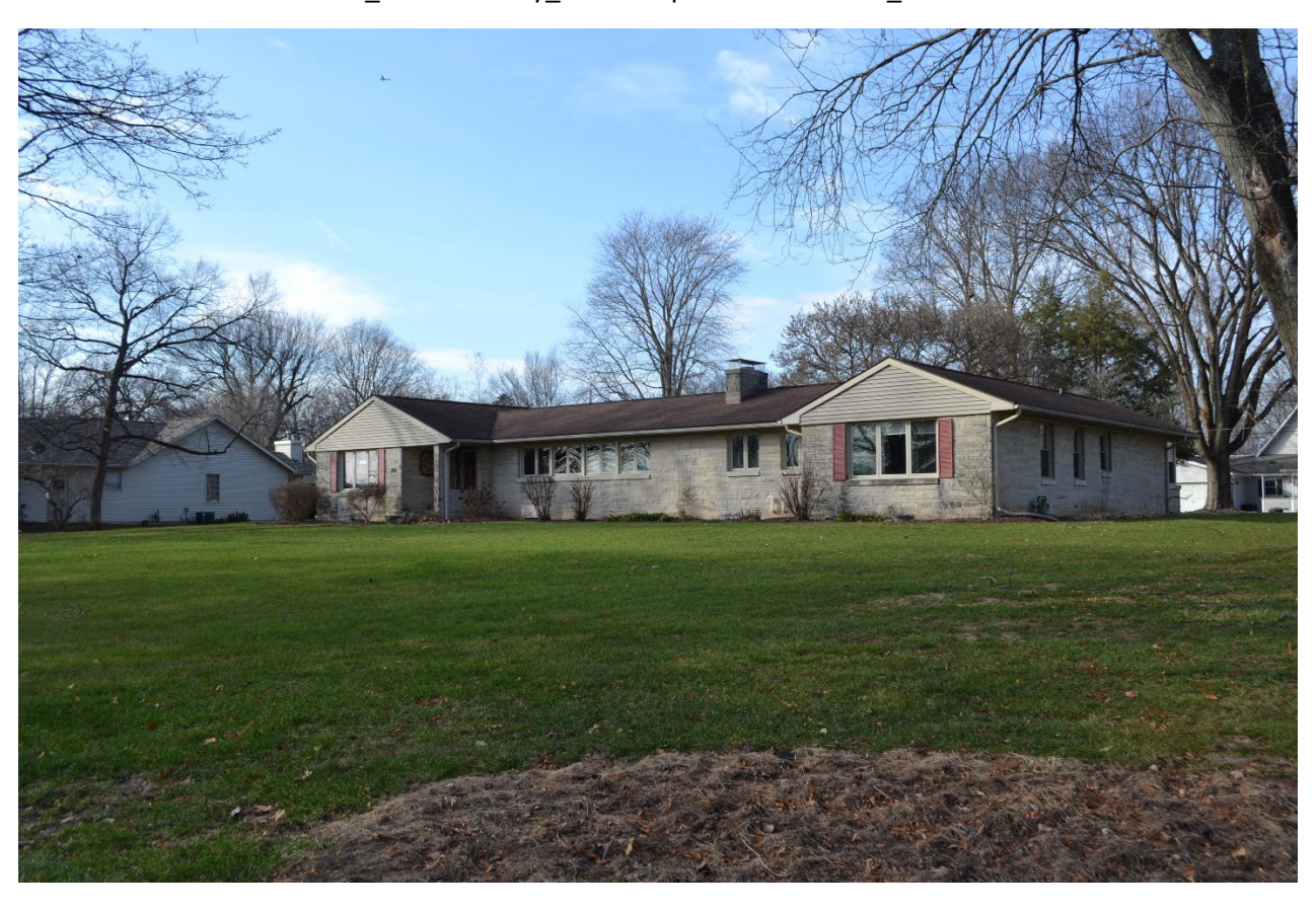
IN\_Carroll County\_South Delphi Historic District\_0013