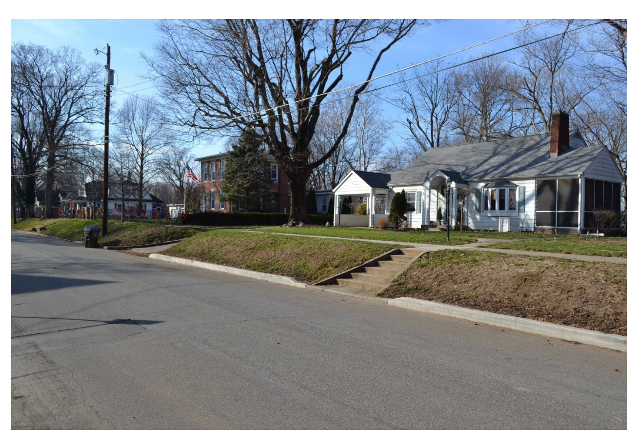
IN\_Carroll County\_South Delphi Historic District\_0007