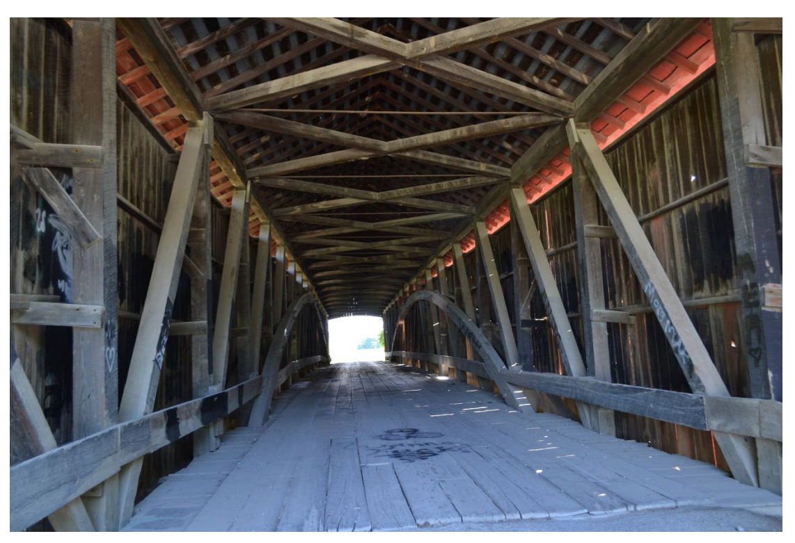
IN\_PutnamCounty\_Oak all a Covered Bridge\_0004