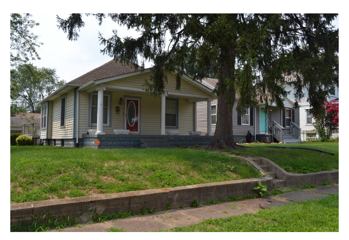
IN\_Clark County\_Patters on Place Historic District\_0031