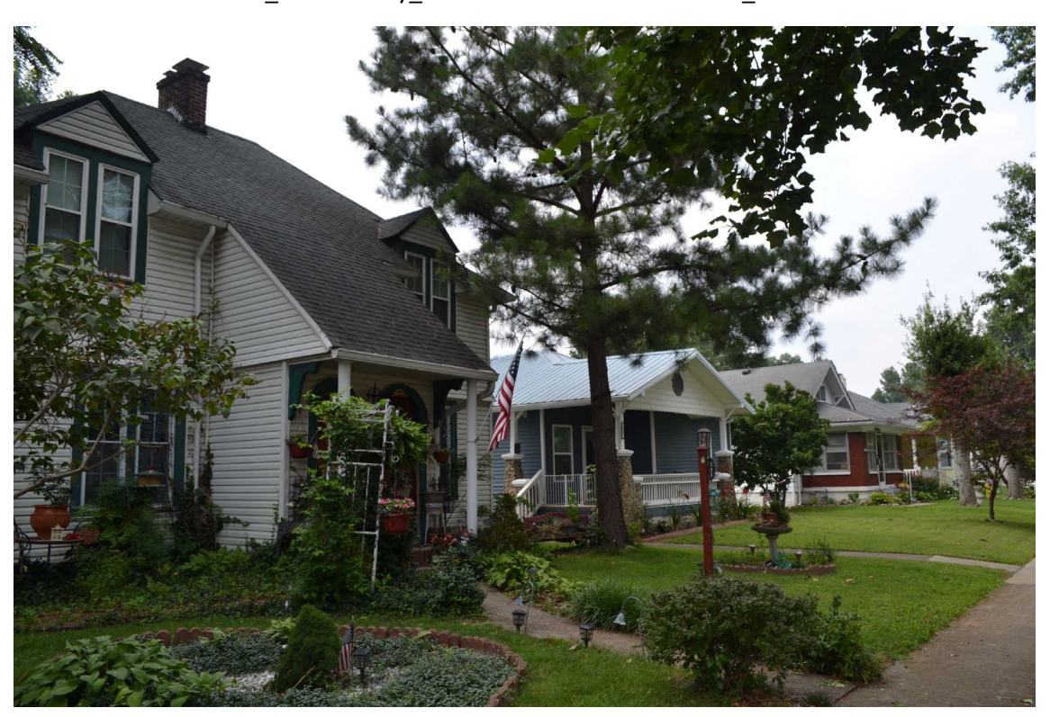
IN\_Clark County\_Patters on Place Historic District\_0033