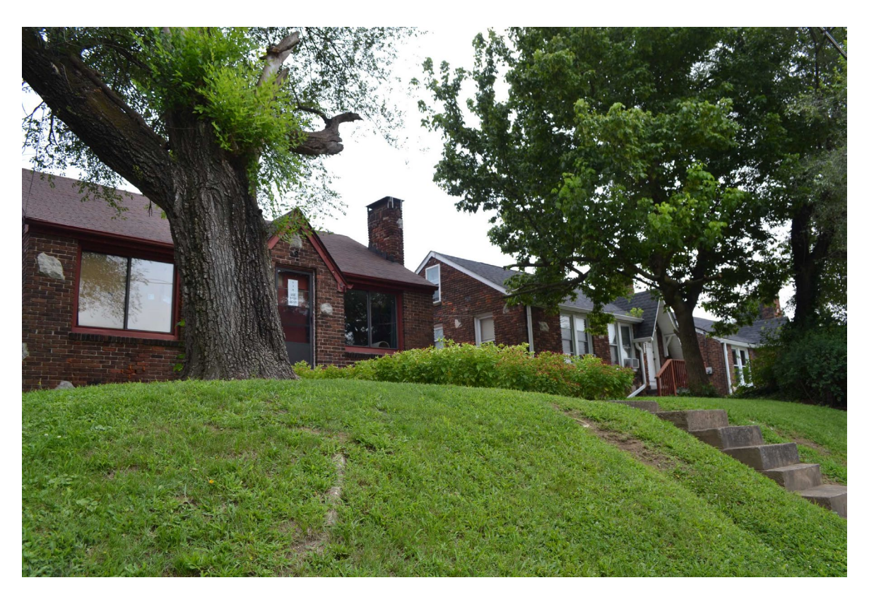
IN\_Clark County\_Patters on Place Historic District\_0016