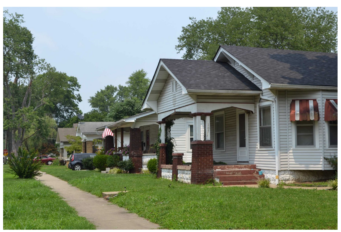
IN\_Clark County\_Patters on Place Historic District\_0029