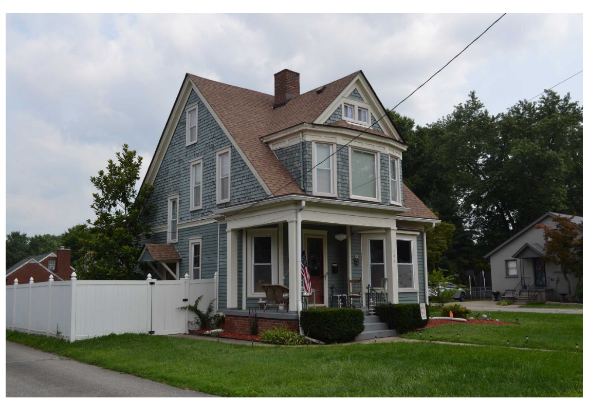
IN\_Clark County\_Patters on Place Historic District\_0002