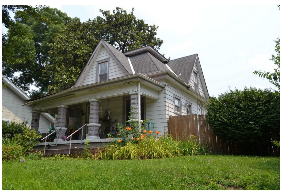
IN\_Clark County\_Patters on Place Historic District\_0014