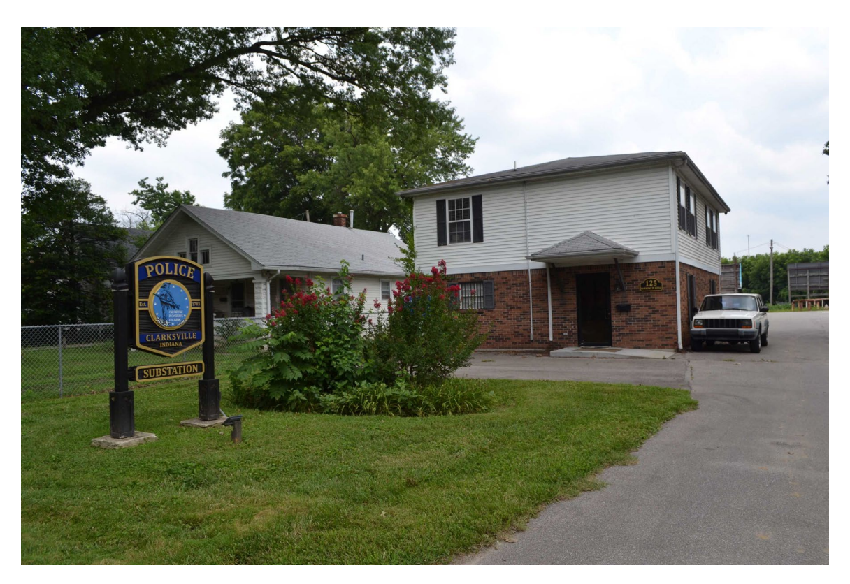
IN\_Clark County\_Patters on Place Historic District\_0004