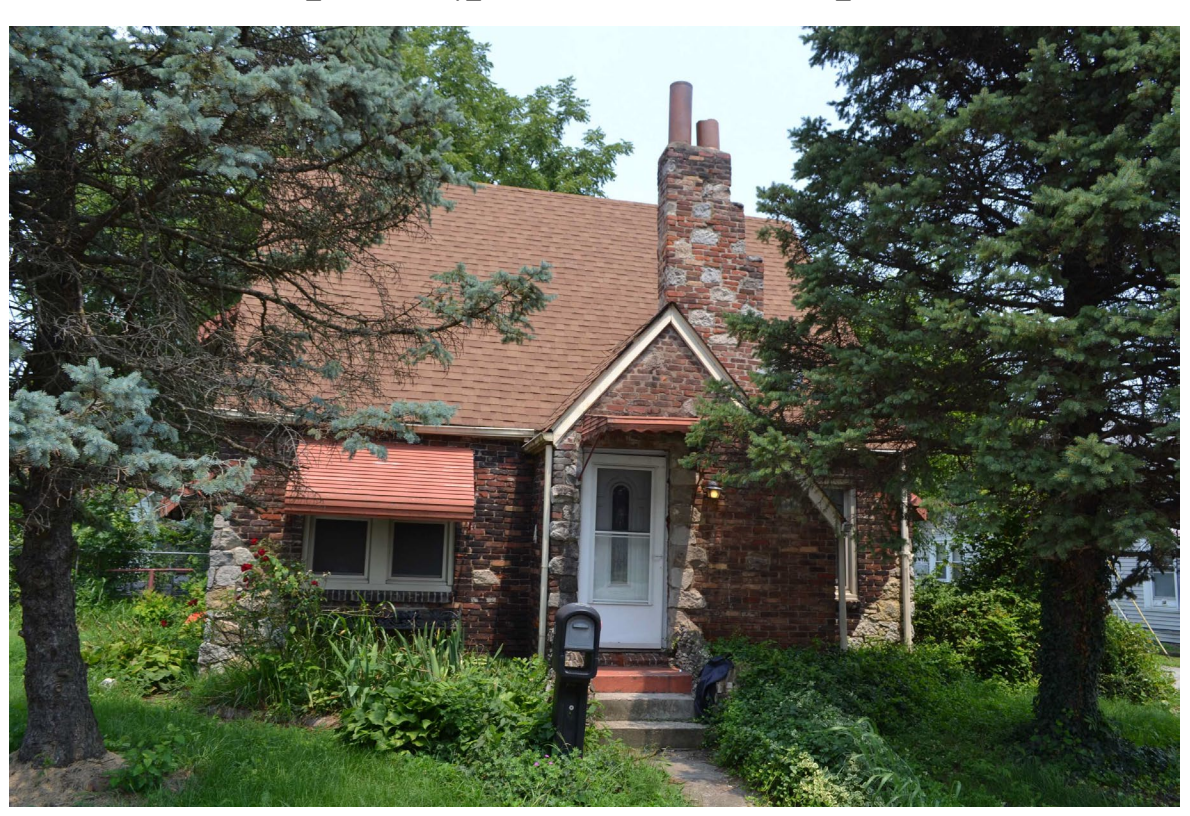
IN\_Clark County\_Patters on Place Historic District\_0010