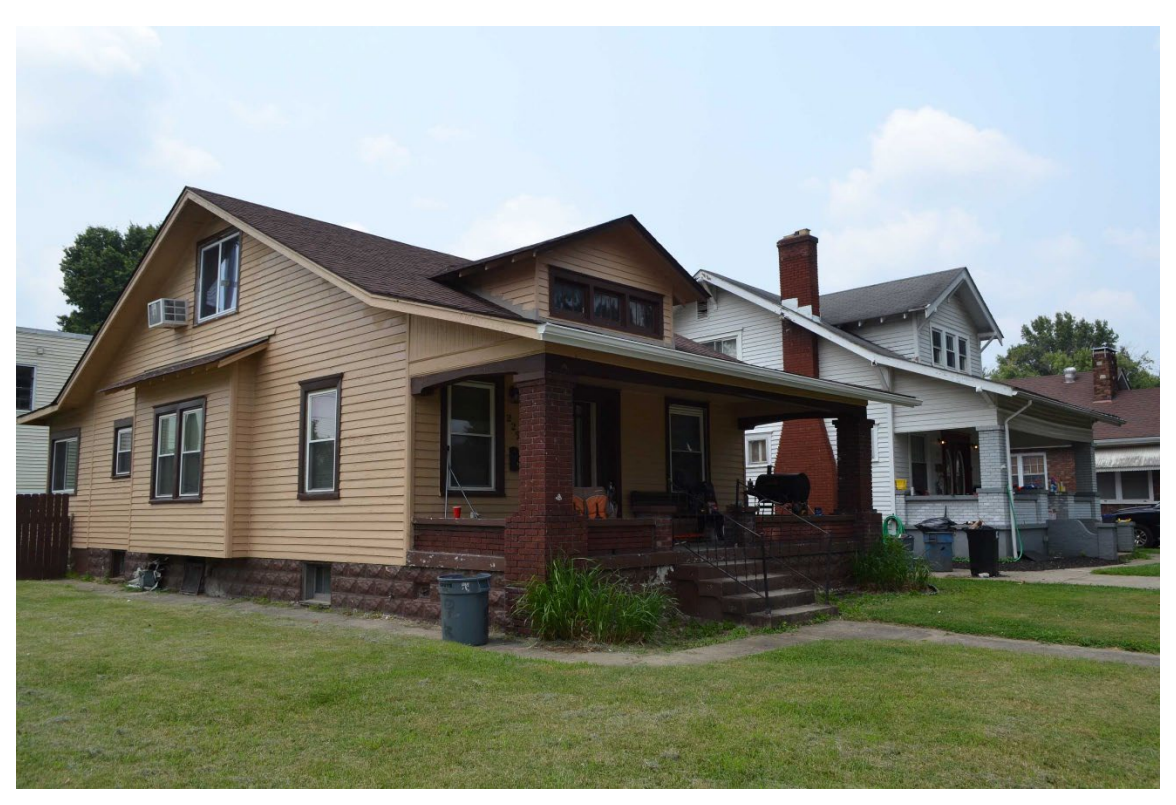
IN\_Clark County\_Patters on Place Historic District\_0025