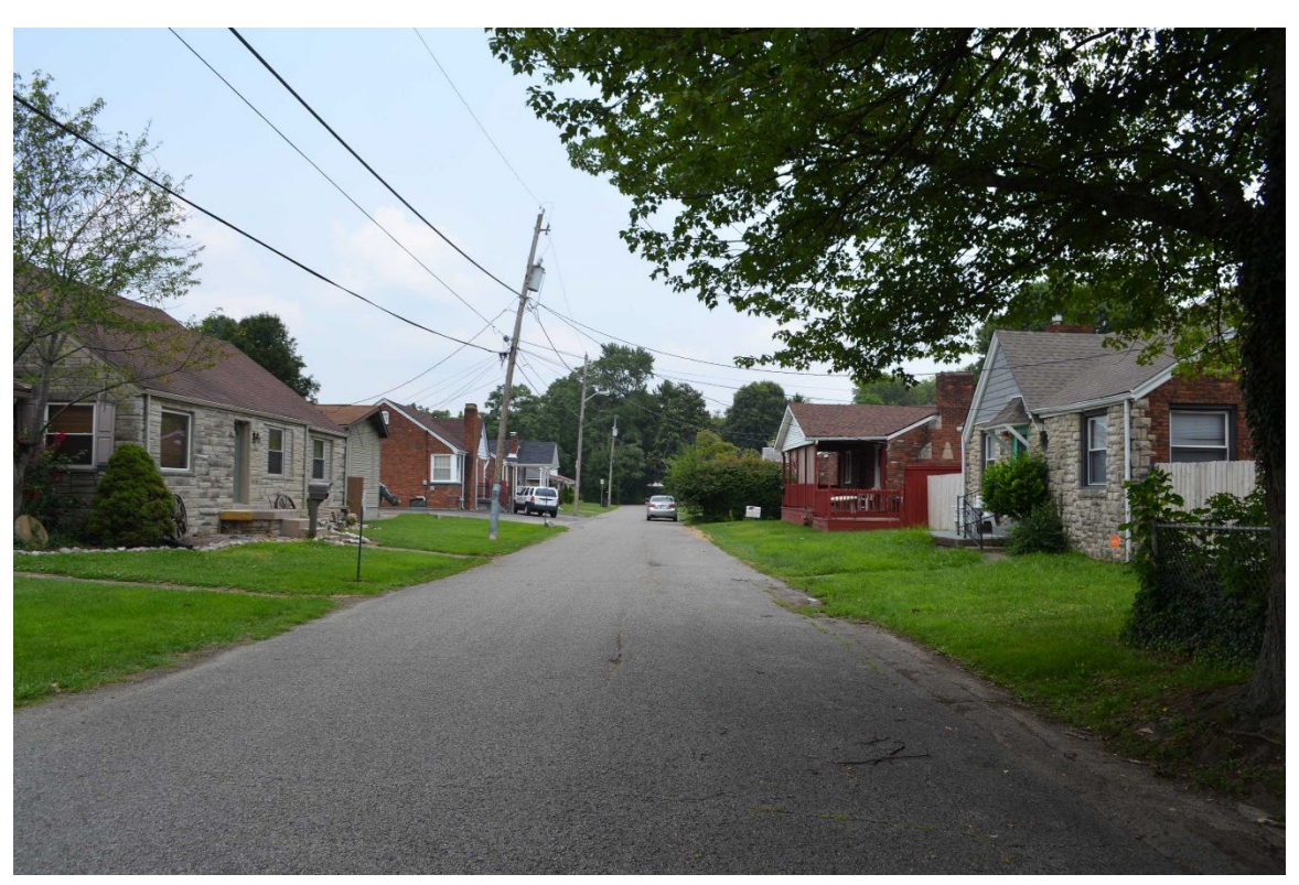
IN\_Clark County\_Patters on Place Historic District\_0017