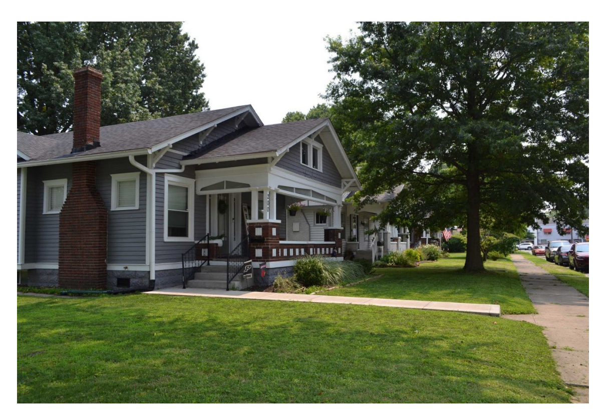
IN\_Clark County\_Patters on Place Historic District\_0022