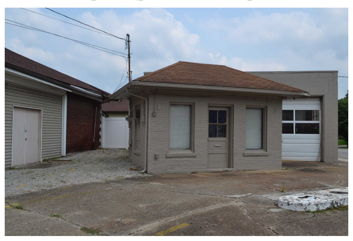
IN\_Clark County\_Patters on Place Historic District\_0007