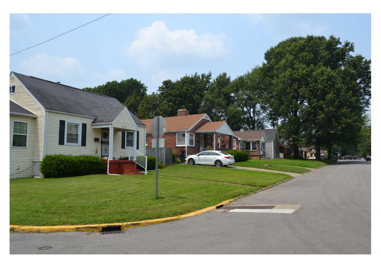
IN\_Clark County\_Patters on Place Historic District\_0026