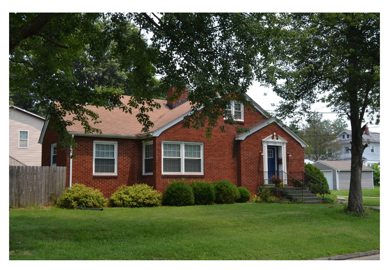
IN\_Clark County\_Patters on Place Historic District\_0008