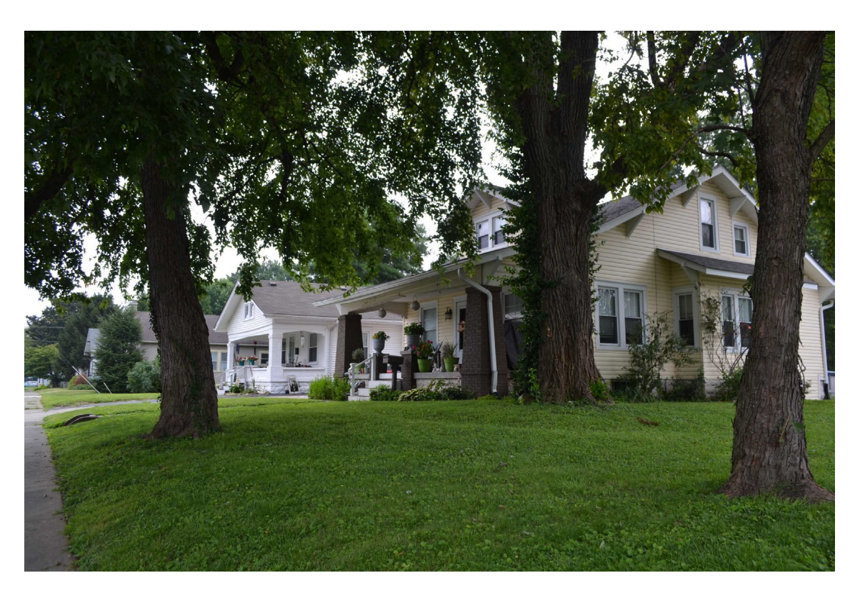
IN\_Clark County\_Patters on Place Historic District\_0001