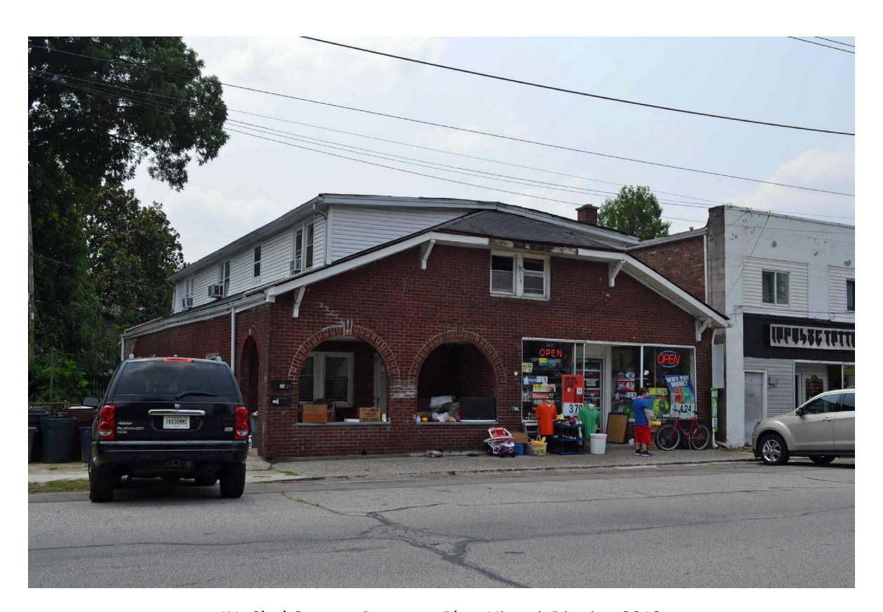
IN\_Clark County\_Patters on Place Historic District\_0012