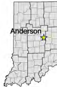
Anderson Urban Tree Canopy Cover 2010 USDA NAIP Imagery

This factsheet is part of a larger project that included an urban tree canopy analysis of 108 communities throughout the State and identified statewide threats and environmental pressures that affect Indiana's urban tree canopy. For more information, please contact Pamela Louks, Indiana DNR-Community and Urban Forestry, at 317-591-1170.