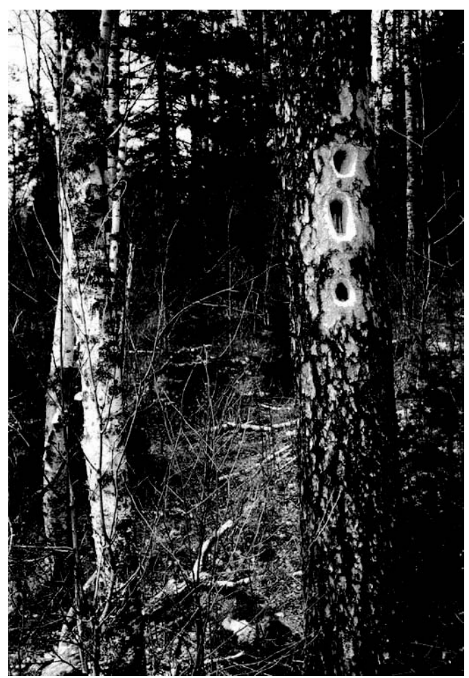
Leave this wildlife tree if it will not endanger a target, the target can be moved, or the tree can be reduced in size to prevent damage to a target.

Creating wildlife habitat is a corrective action that is often overlooked. Corrective actions should be selected with safety first and foremost; however, options exist that can