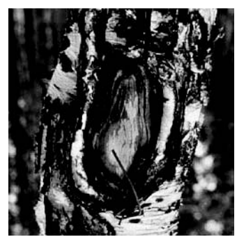
The canker and associated wood decay have seriously weakened the stem of this birch tree.