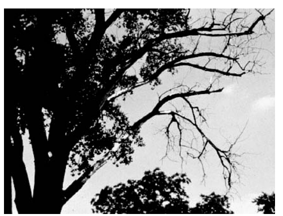
Dead branches can break and fall at any time.