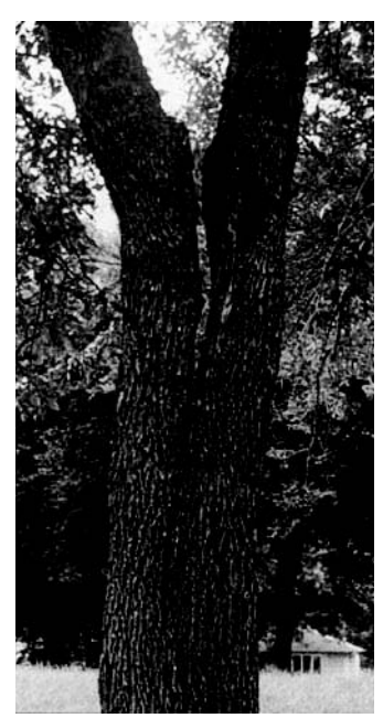
This weak branch union has developed a crack, creating a highly hazardous situation.

•A crack extends deeply into, or completely through the stem.