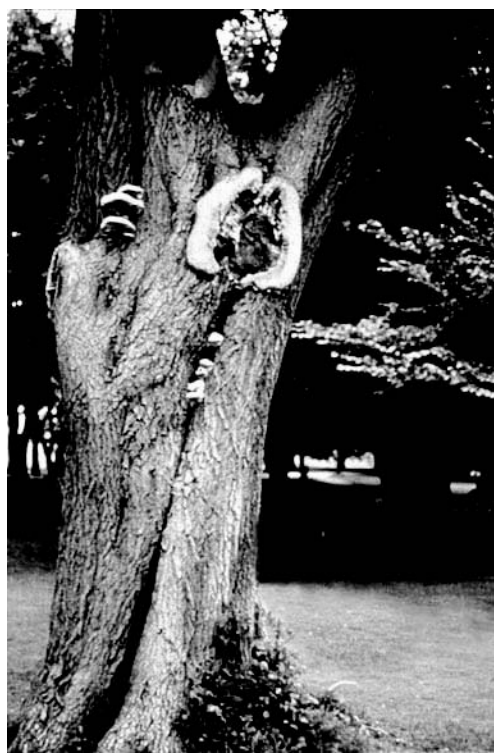
This tree has multiple defects present (advanced wood decay with fungal conks, and a large crack) and should be removed.