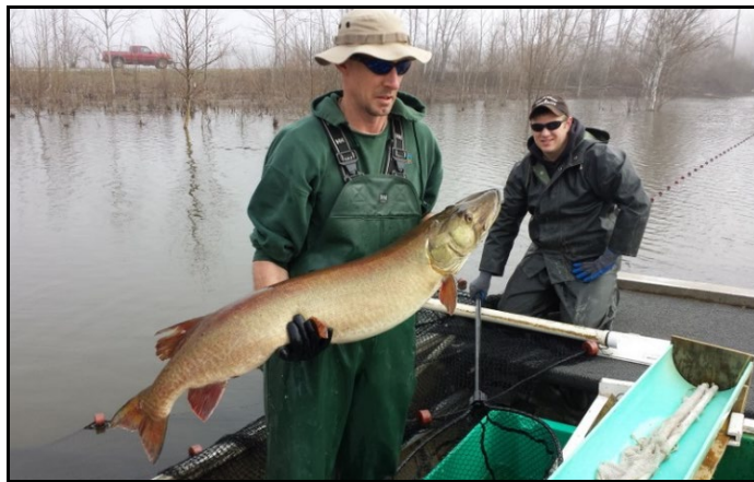
48" Muskie collected from a 2016 netting survey.

Muskie, Bluegill, and Crappie Catch during 2016 netting surveys.