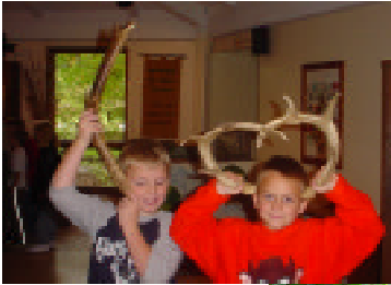
Students explore Pokagon Interpretive Center; the Bronnengberg Home at Mounds

Interpretive Centers. Many visitors make our interpretive centers one of their first stops when visiting a property. These centers provide information about everything from poison ivy to bird sightings to good hiking trails. Most centers have live snakes, turtles, salamanders and fish in the summer. Many have bird viewing windows where, in air-conditioned comfort, you can watch chickadees,