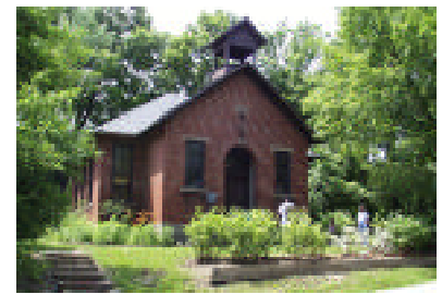
The Interpretive Center at Chain O'Lakes State Park is an old schoolhouse. It is open seasonally.

woodpeckers, squirrels and chipmunks and other wildlife. We operate thirteen nature centers year round and nine additional centers during the summer season.