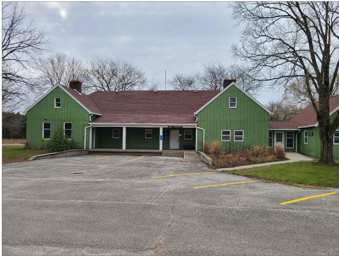
BUILDING FRONT - NORTH SIDE