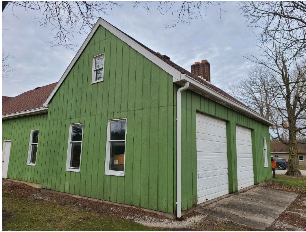
SOUTH EAST CORNER