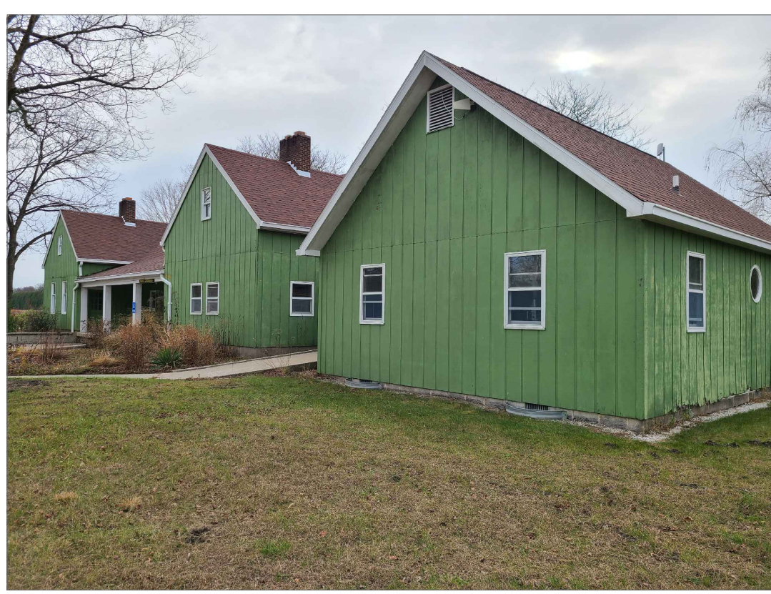
NORTH WEST CORNER