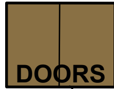
Front entry doors

SITE DETAILS Proposed Vault Location over 100' from closest property line. No pond or lake exists within 100' of proposed location. Closest potable water line is over 10' away.