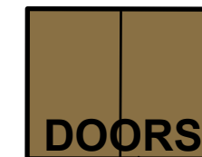
Front entry doors

Closest potable water line is over 10' away.