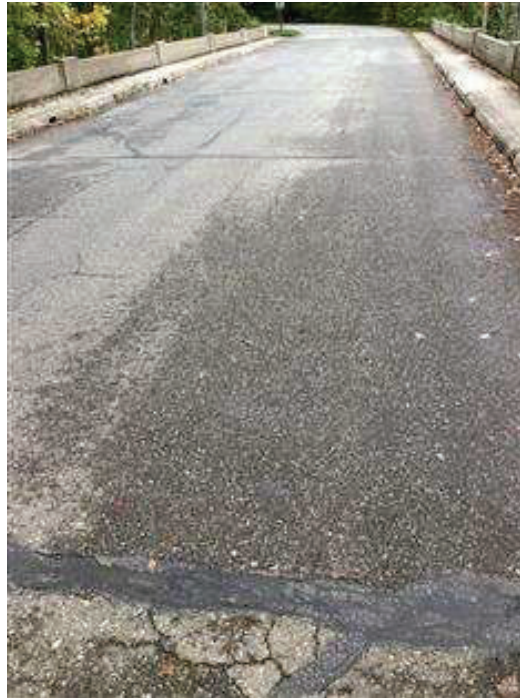
PHOTO 7 Condition Description Wearing surface