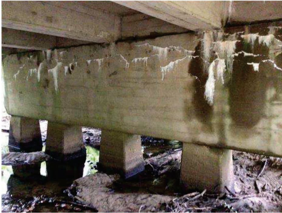
PHOTO 5 Condition Description Pier 2