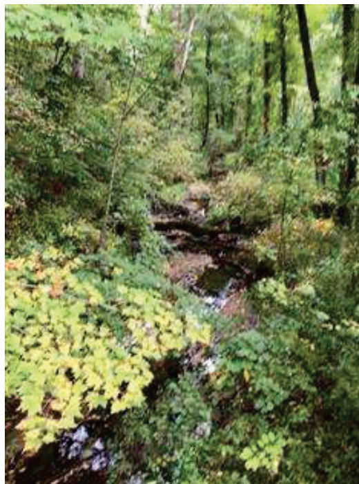
PHOTO 20 Condition Description North channel alignment