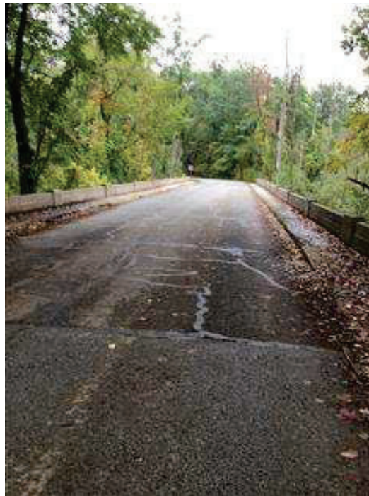
PHOTO 9 Condition Description East road alignment