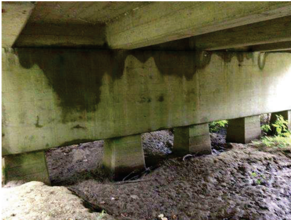
PHOTO 4 Condition Description Pier 4