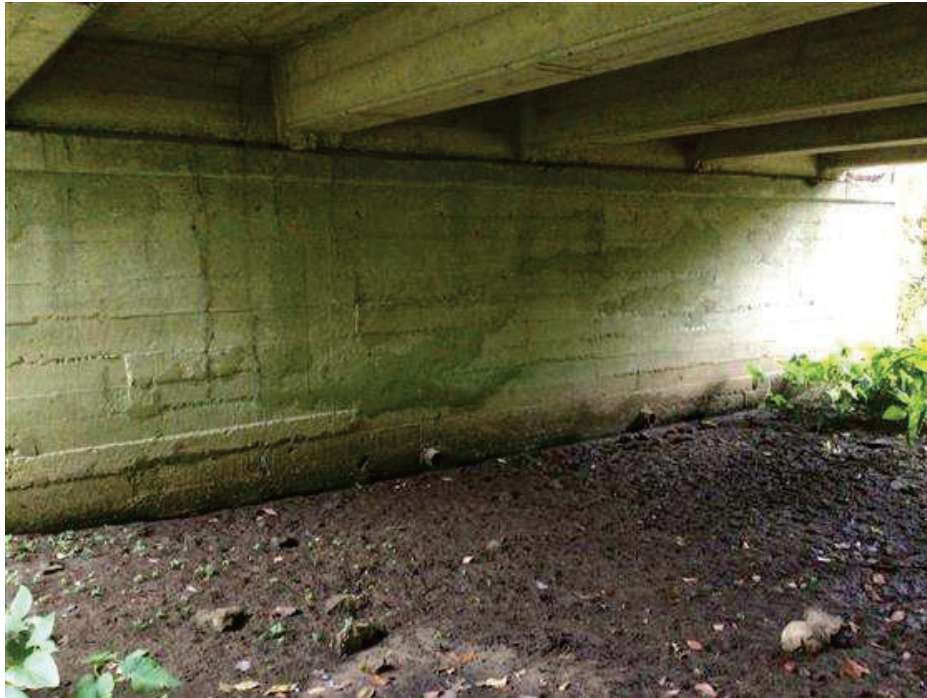
PHOTO 19 Condition Description Abutment 9