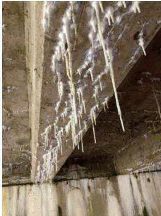
PHOTO 22 Condition Description Activity growing efflorescence on beams in span f