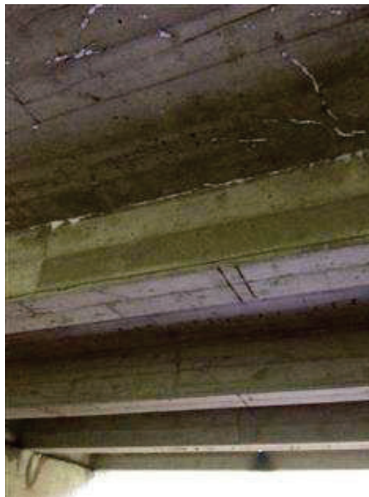
PHOTO 8 Condition Description Span c