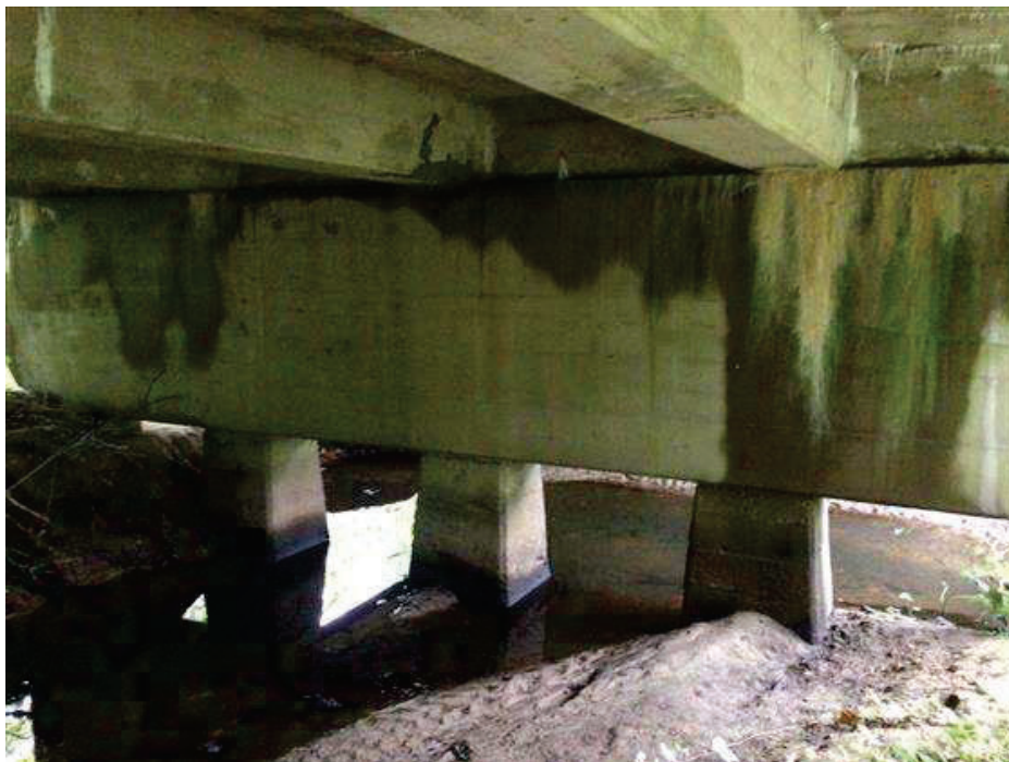
PHOTO 6 Condition Description Pier 3