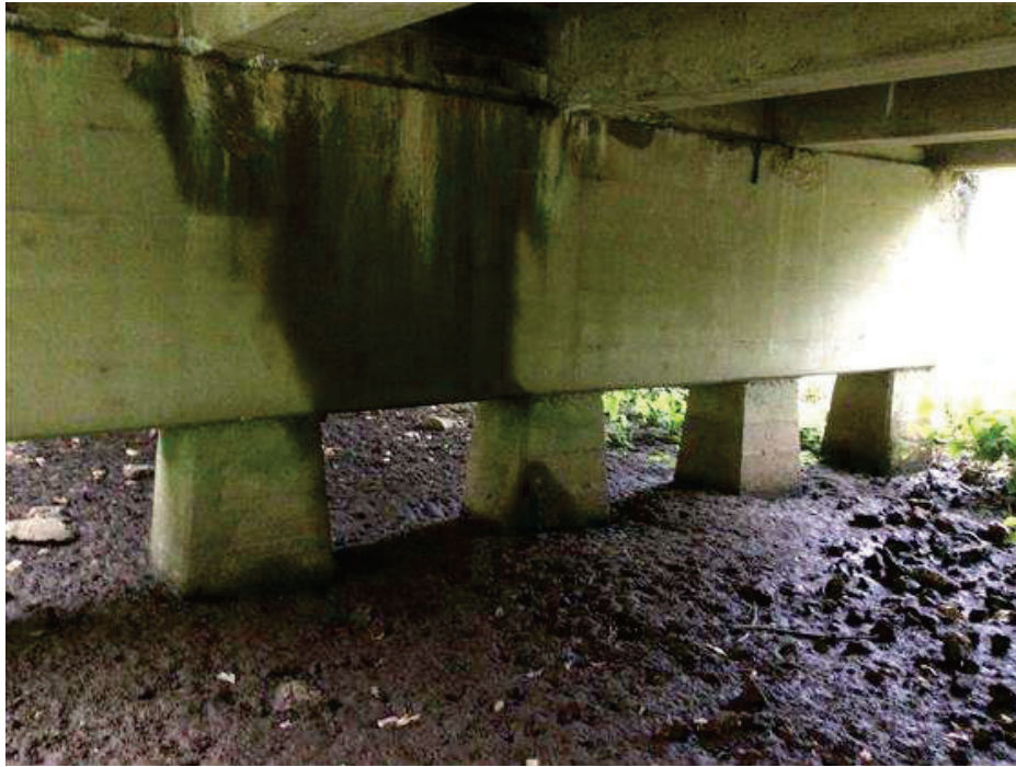
PHOTO 23 Condition Description Pier 8