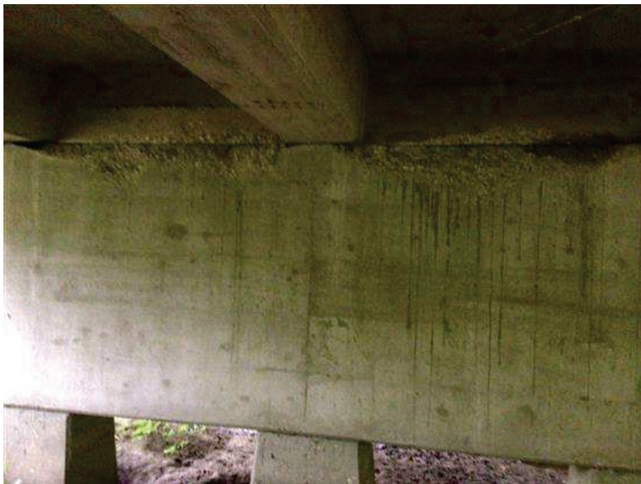
PHOTO 14 Condition Description Spalling on pier 4