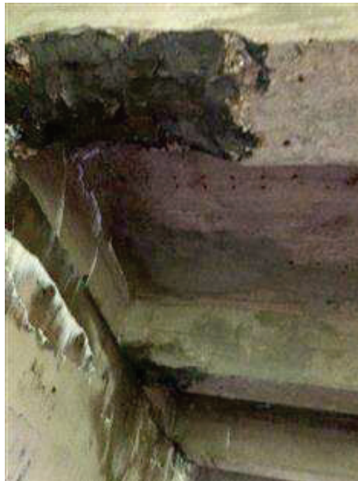
PHOTO 2 Condition Description Span b, beam patching