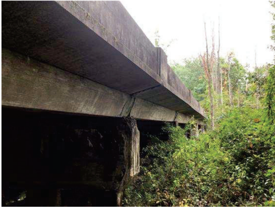
PHOTO 1 Condition Description South profile