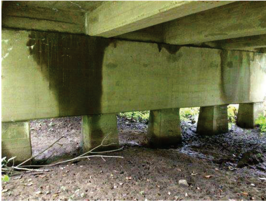
PHOTO 11 Condition Description Pier 6