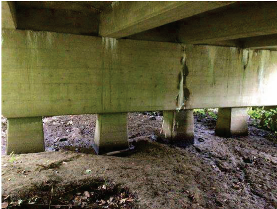
PHOTO 12 Condition Description Pier 5