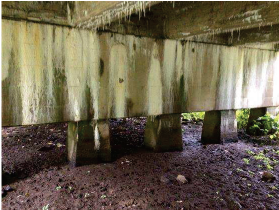
PHOTO 16 Condition Description Pier 7