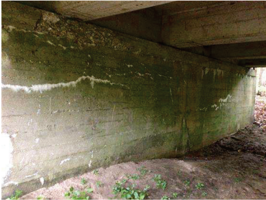
PHOTO 3 Condition Description Abutment 1 looking north