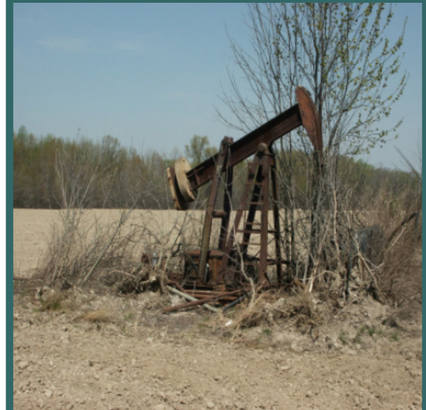
Orphaned oil well in Pike County

DNR Indiana Department of Natural Resources