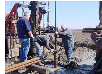
Well plugging contractor at work in Knox County

Work performed on an abandoned oil or gas well should only be performed by a qualified well plugging contractor. Removing equipment from a well