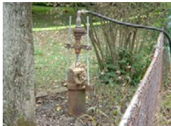
Orphaned gas well in Marion County

whether the well is in an area subject to frequent flooding or close to streams or other environmentally sensitive areas; or whether the well currently poses a significant impediment to existing or proposed commercial or residential development, or to mineral