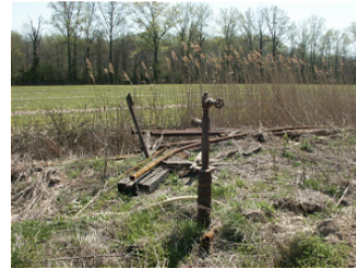
Orphaned well in Warrick County

extraction, agricultural, or industrial operations.