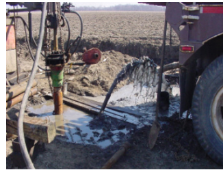
Pumping cement into a well

An orphaned well is an oil or gas well that has been abandoned by its operator without properly plugging the well, and the operator or owner of the well is unknown.