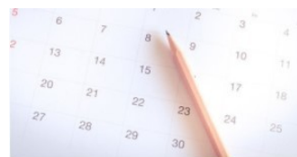
NIMS/CPG Survey Responses Due

NIMS/CPG 101 Survey Responses are due Nov. 30