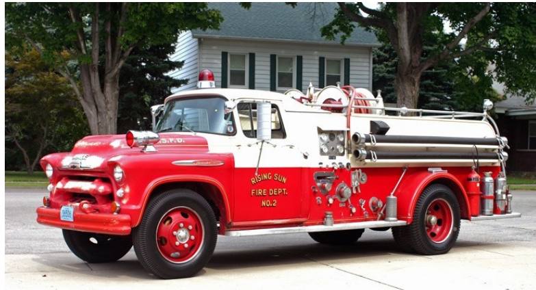
Pictured above: The Rising Sun Fire-Rescue Emergency Medical Service's 1957 Howe Pumper. This apparatus still works and passes its pump test every year but is primarily relegated to parade duty.

runs each year and provides fire, rescue and first responder medical services to approximately 5,800 residents and 69 square miles. Their area includes 3/4 of Ohio County within Randolph, Cass and Union townships.