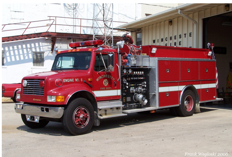
The Winchester Fire Department's Engine No. 6.

Established in 1897, the Winchester Fire Department (WFD) is a combination fire department that provides fire, rescue and BLS services to more than 5,000 residents in the town of Winchester, located 90 miles northeast of Indianapolis in central Randolph County. The WFD is composed of 26 members (including two full-time personnel who are on duty at all times) and responds to more than 300 emergency runs each year.