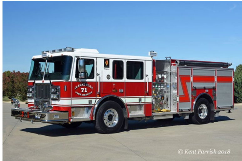
The CFD's fire engine 71, a 2018 Seagrave Marauder II Pumper.

The CFD provides fire, rescue, hazmat and medical first-responder services to the town of Clarksville as well as portions of I-65 and the Ohio River.