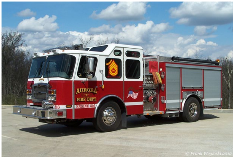
AFD's Engine 516, a 2010 E-One Typhoon Pumper. This former demo apparatus is equipped with a set of TNT extrication tools and a 10 kW generator.

The Aurora Fire Department (AFD) is an all-volunteer fire department that includes 35 members who respond to 400 runs each year. Located in the city of Aurora, the AFD is a combination of two former fire companies that existed in the city during the late 1800s. Combining into the present-day AFD in 2003, this fire department provides fire, rescue and extrication protection services for roughly 8,000 Hoosiers in approximately 25 square miles.