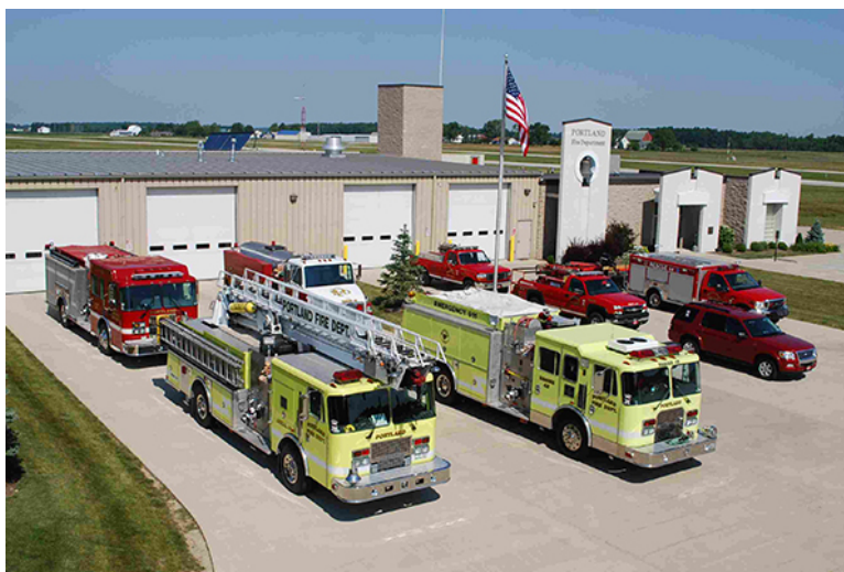
Overhead view of the PFD's fire apparatuses.

The Fire and Public Safety Academy is dedicated to providing outstanding customer service and delivering professional fire and public safety training, education and certification to Indiana's first responders in support of the Indiana Department of Homeland Security's mission of protecting the people, property and prosperity of Indiana.