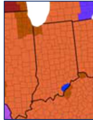
Figure 2-Indiana Fuel Supply Regions

Development of the updated NIRPC emission rates uses default MOVES2014 fuel formulation assumptions based on each county's Fuel Supply Region, and defaults to summer conditions.