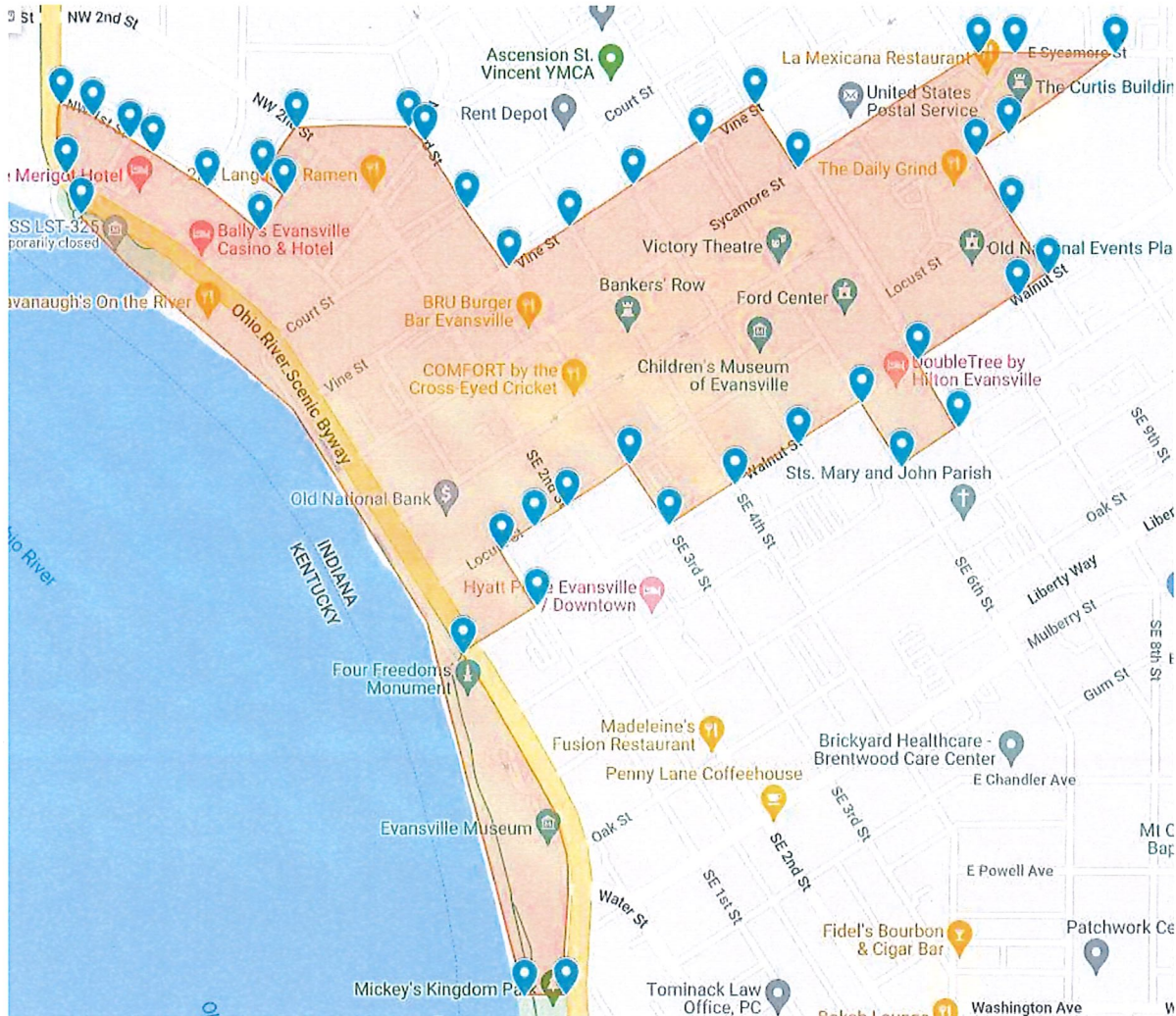
EXHIBIT "A" MAP OF DESIGNATED AREA