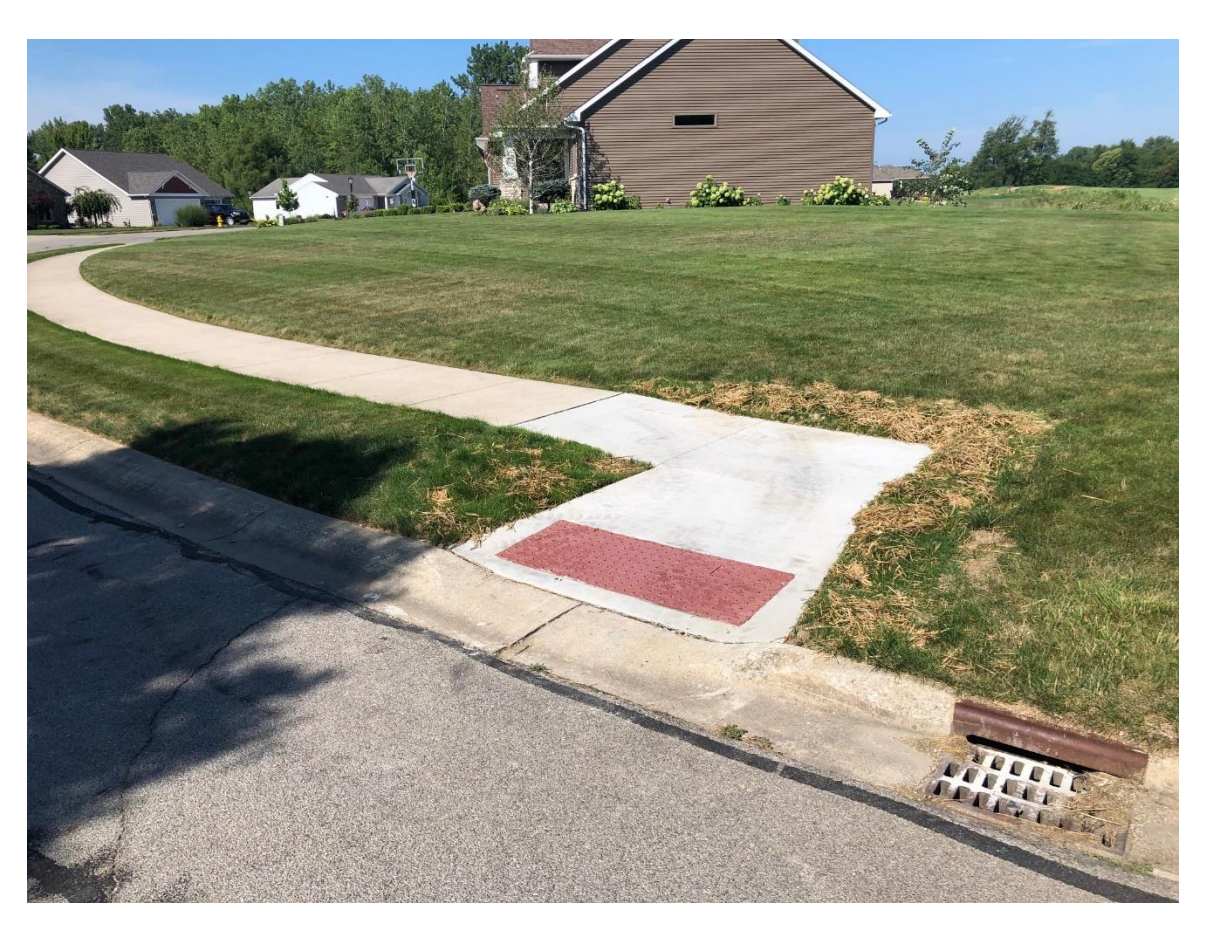
5 – Carnoustie Circle