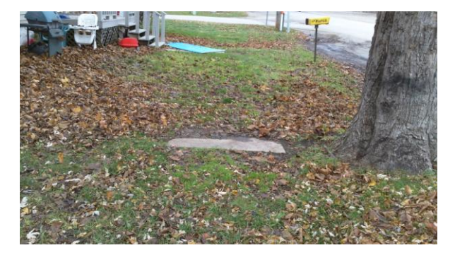
ADA Sidewalk, Wawaka 2016