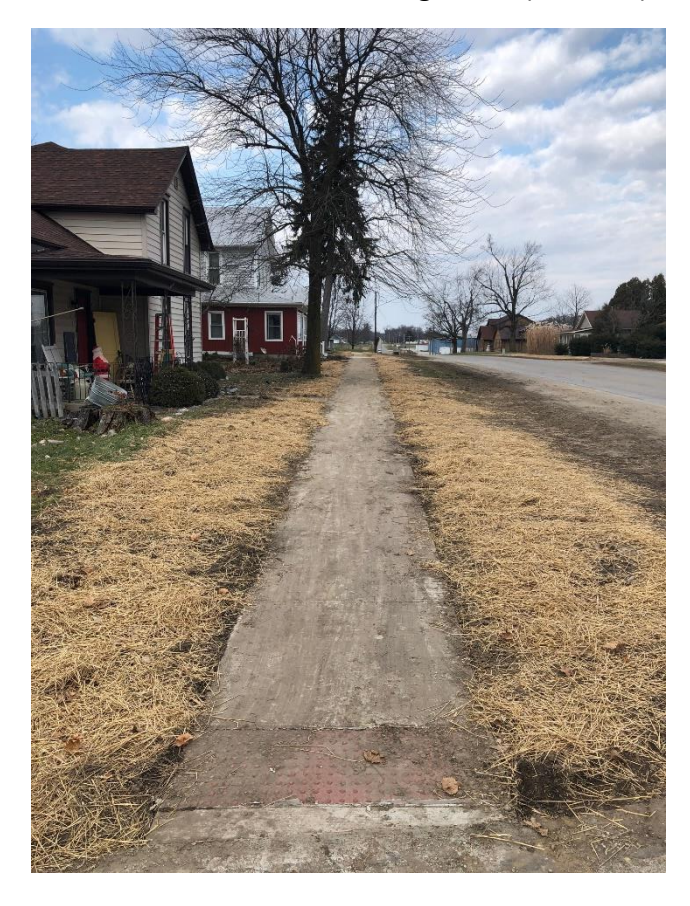
At Simon Street looking North (Westside)