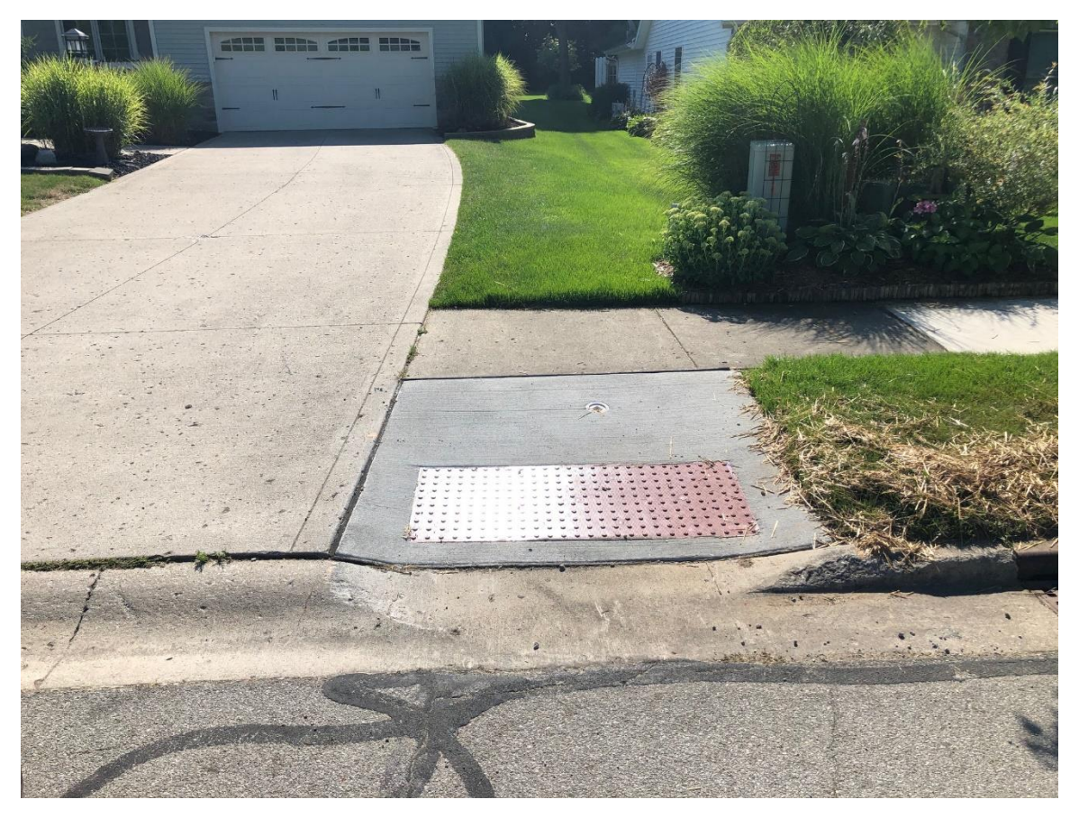
5 – Carnoustie Circle