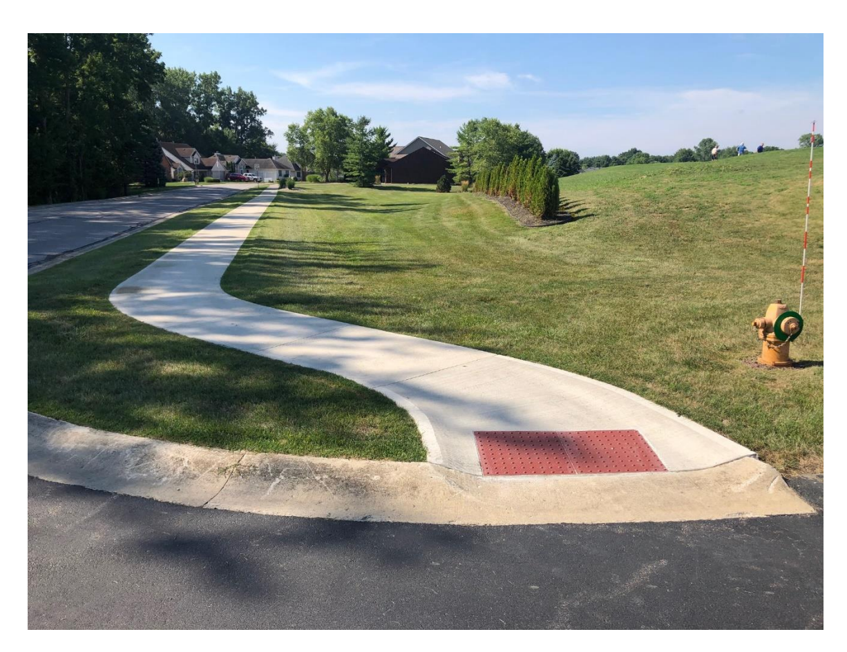
3A – Cobblestone Lane