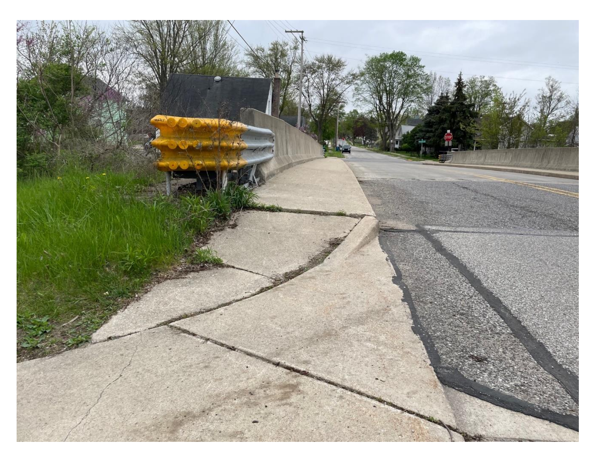
Bridge 1 - Before