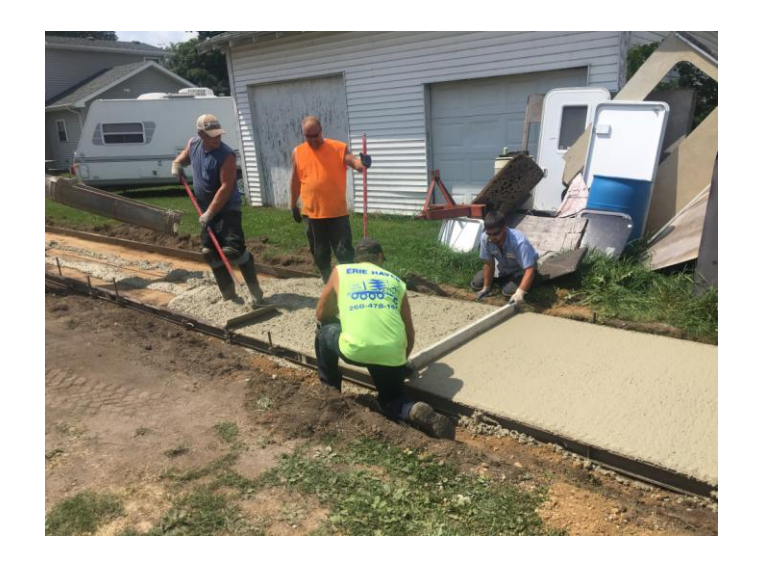
Forms were set and concrete poured on August the 15<sup>th</sup>.