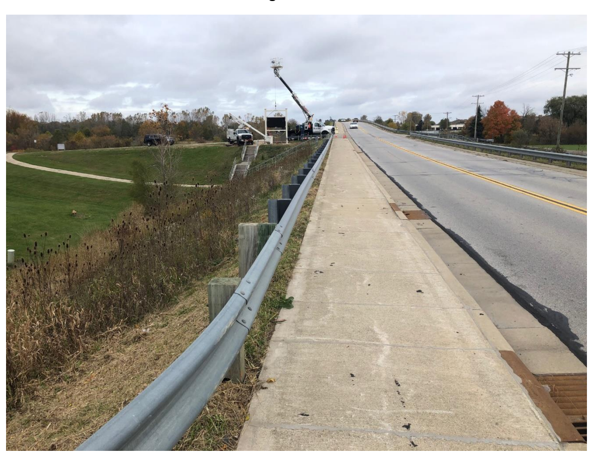
CR 1000 East looking north at Complex Entrance