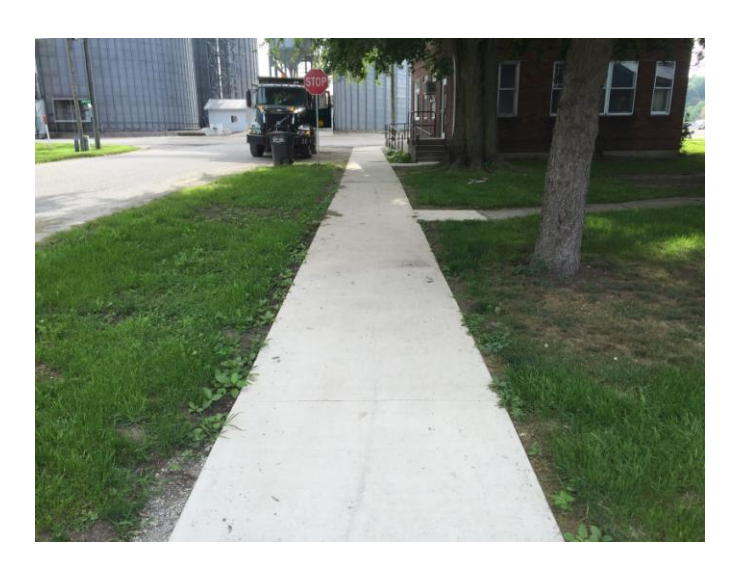
Asphalt was placed to match the concrete to the road.