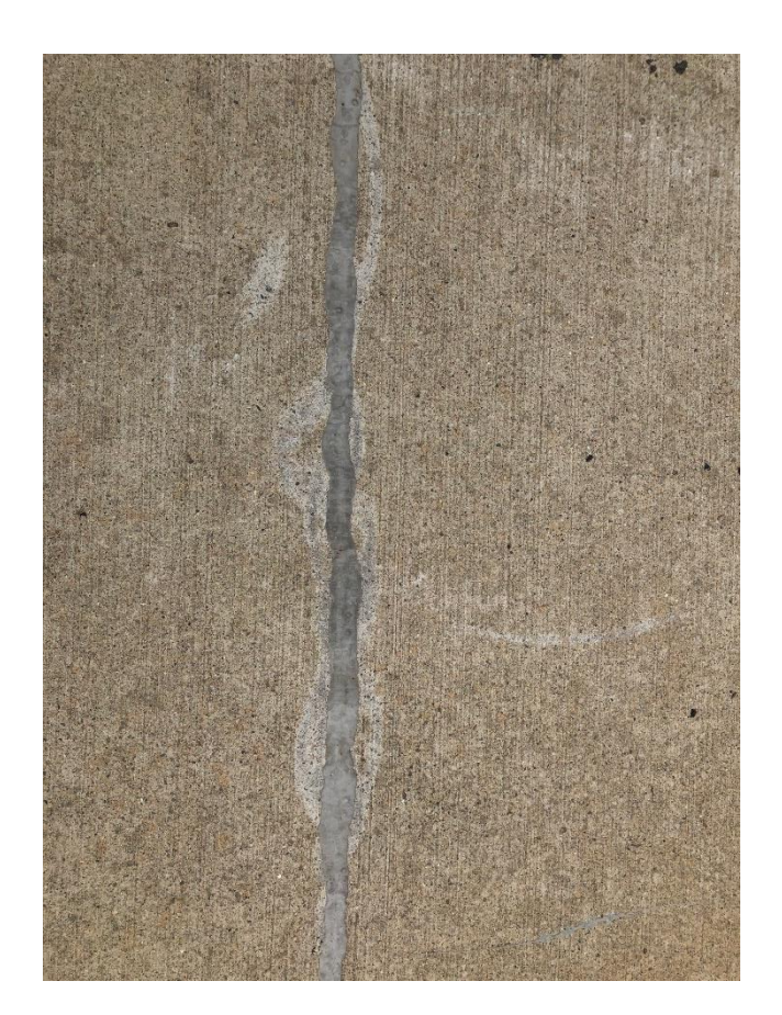
Crackfill / Crackseal (sidewalk joint)