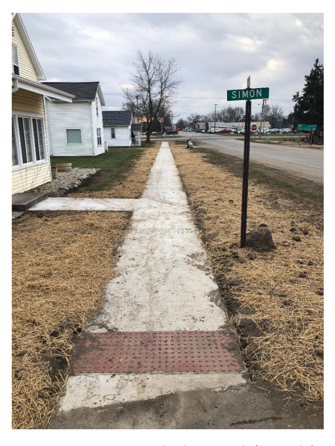
At Simon Street looking South (Eastside)