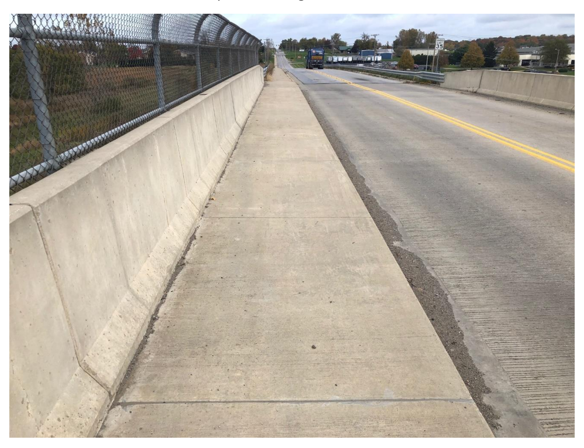
CR 1000 East on Bridge 5 looking north