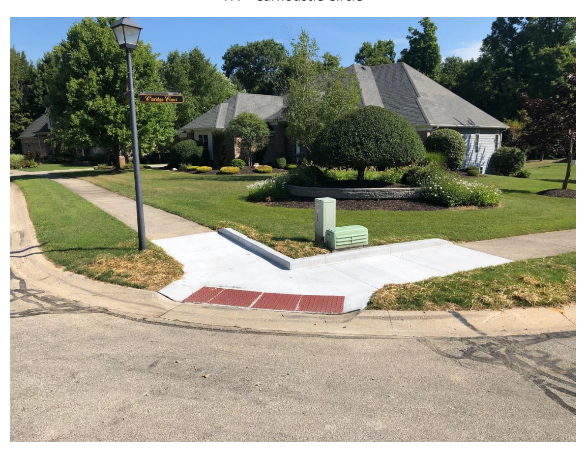
7B – Carnoustie Circle