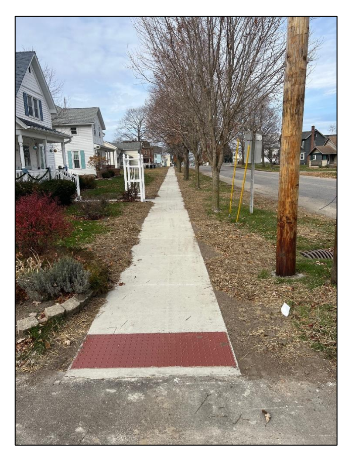
Woodlawn Street (End of Section 15)