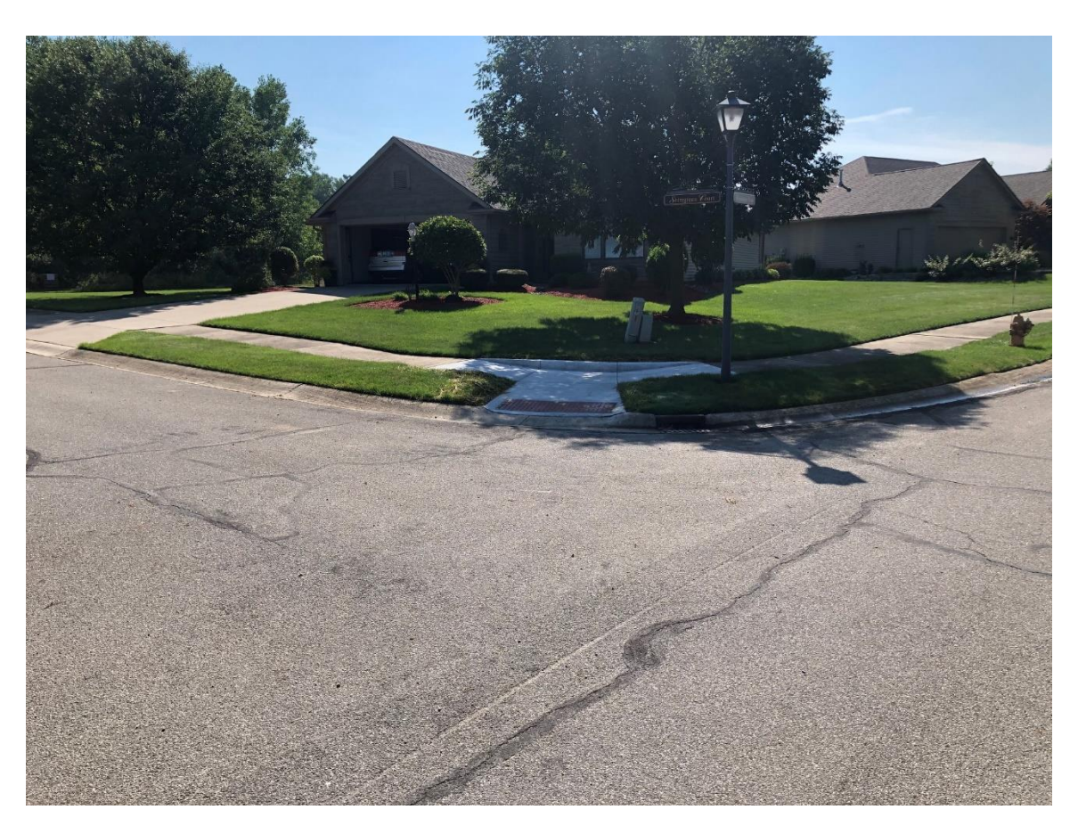
2A – Laurelwood Lane