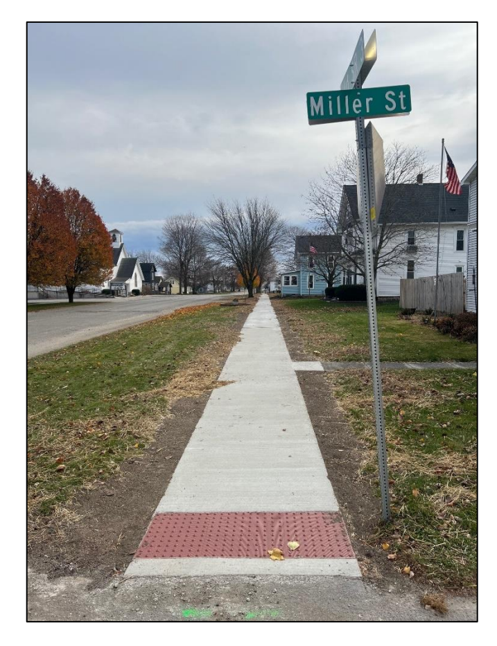
Miller Street (Section 12 to 13 Transition)