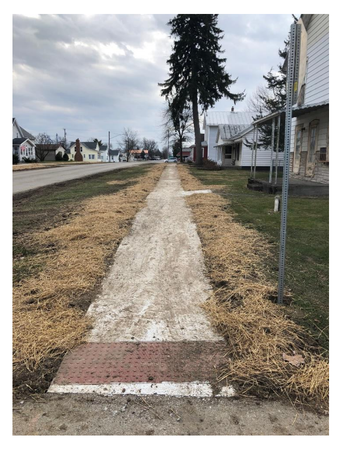
At Vorhees Street looking South (Westside)