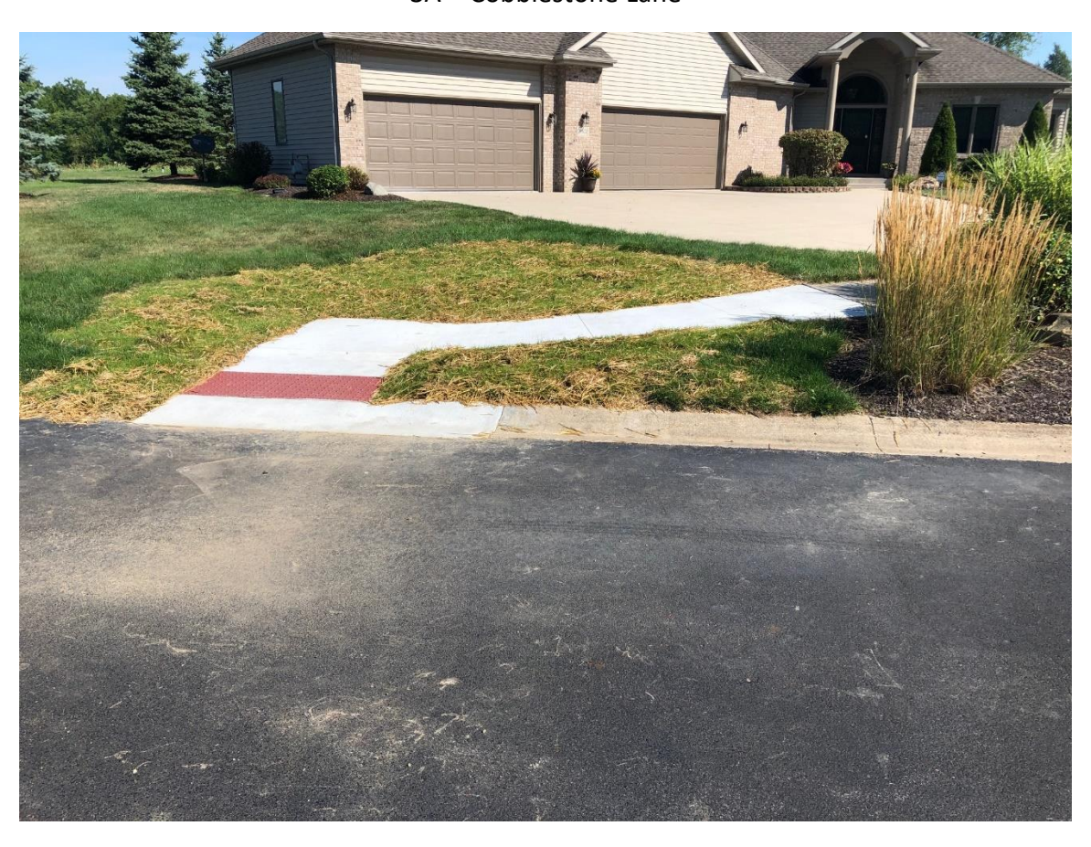
3B – Cobblestone Lane