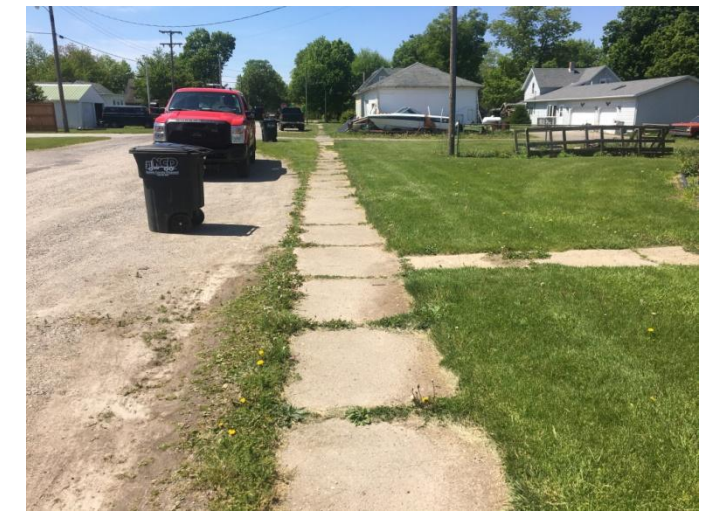
Photos of existing conditions taken summer of 2017 before work began.