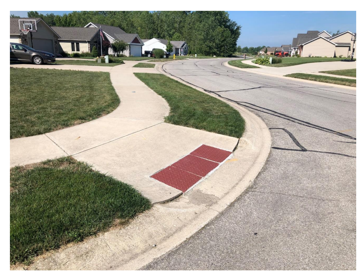
4 – Ballenshire Lane