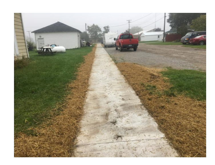
September 14<sup>th</sup> day after seeding.