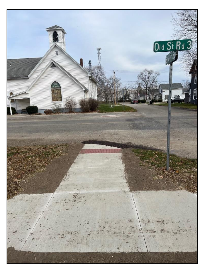
Bilger Street (Section 13 to 15 Transition)