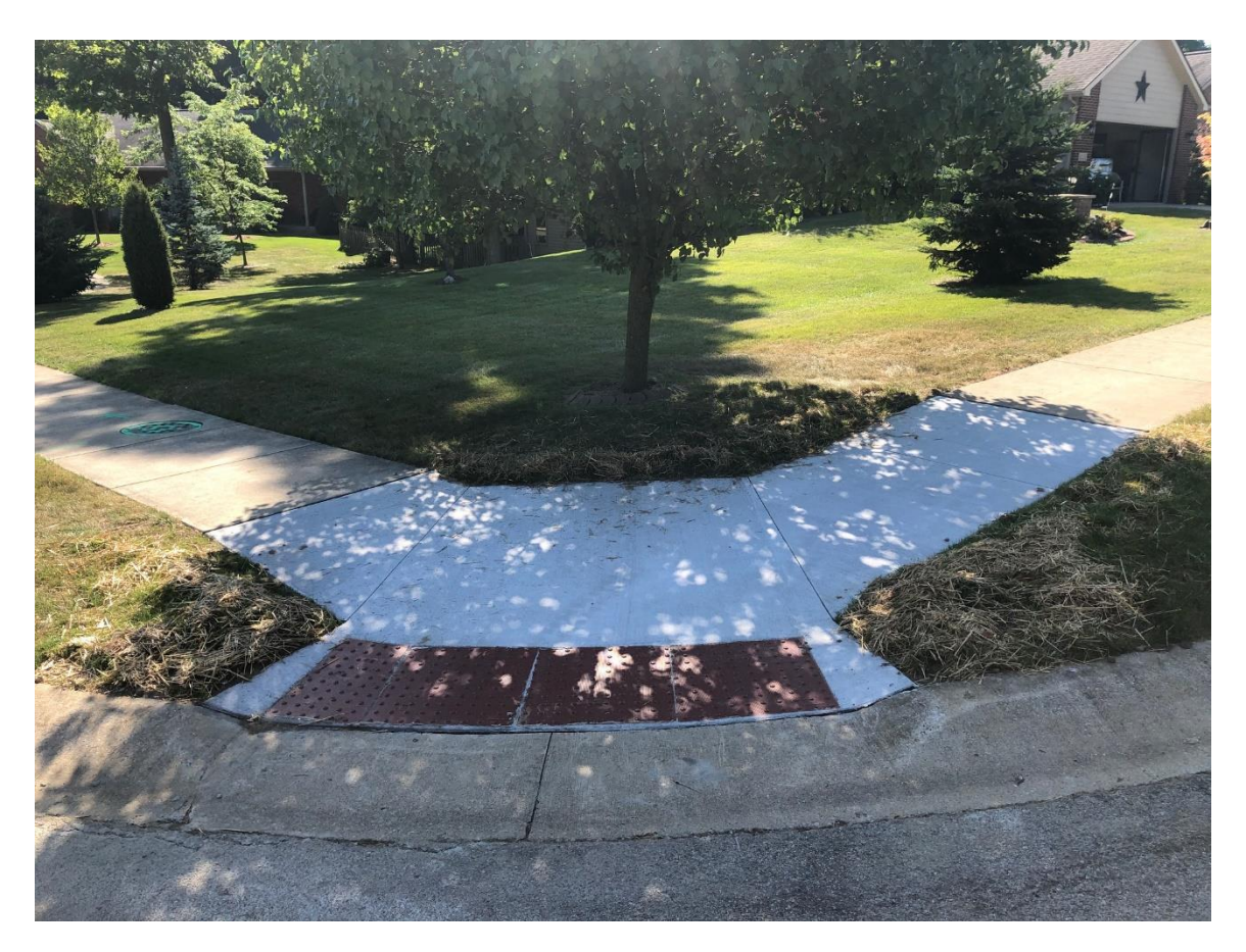
7A – Carnoustie Circle