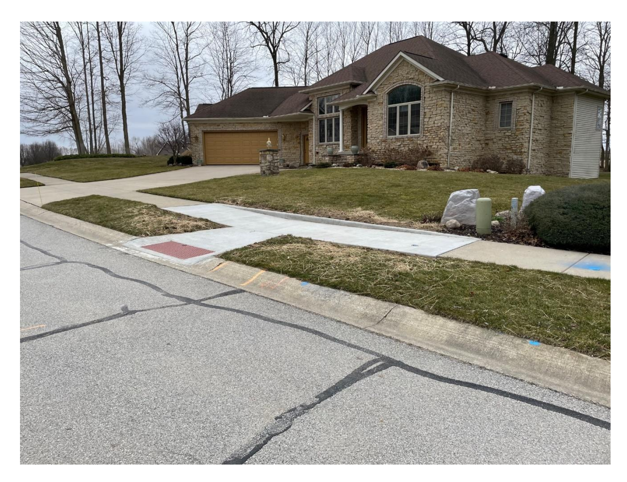
Ramp - 7B