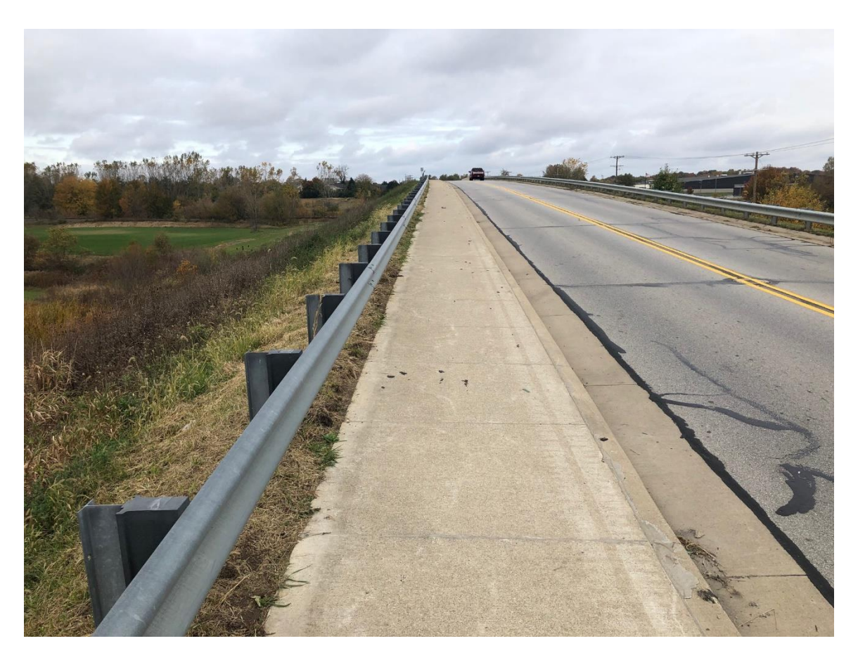
CR 1000 East at Complex Entrance looking north