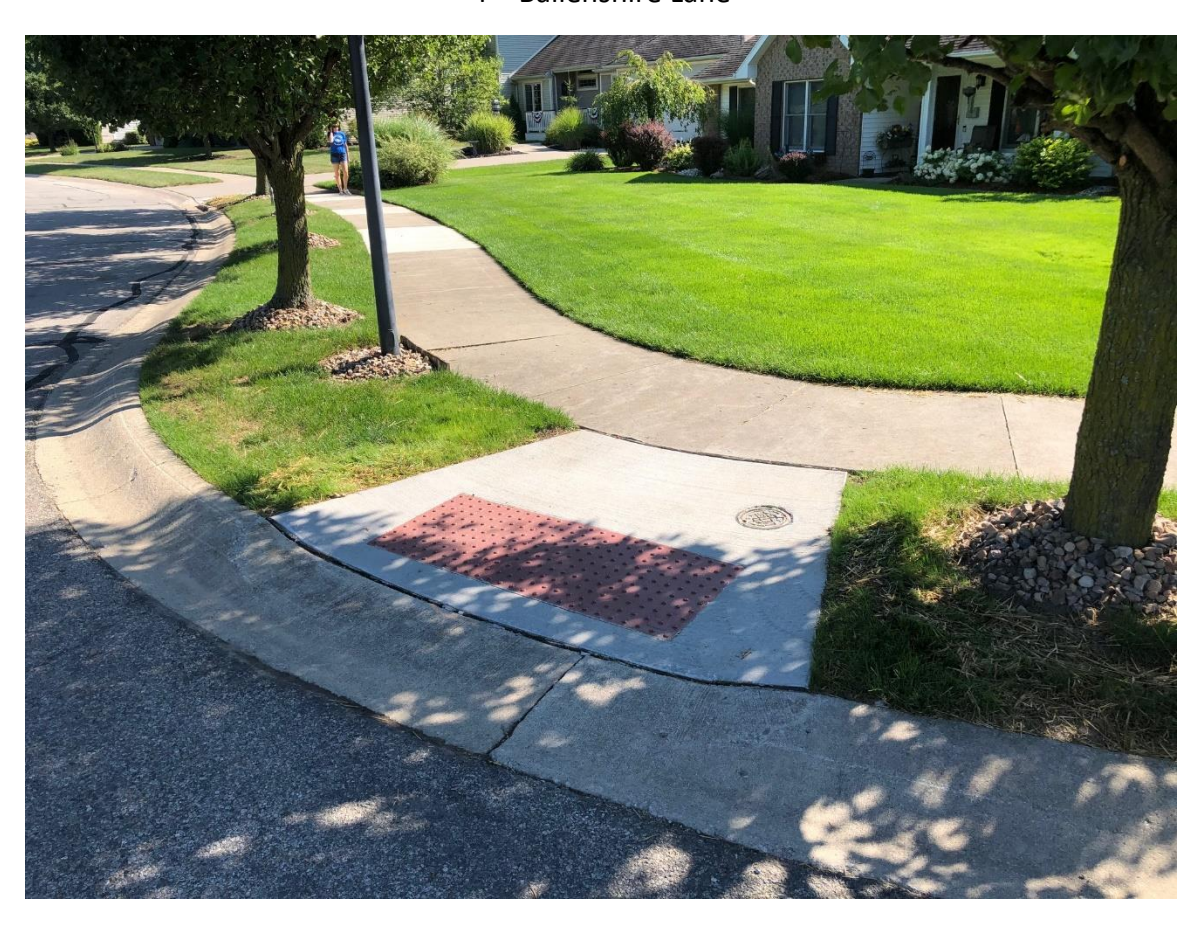
4 – Ballenshire Lane