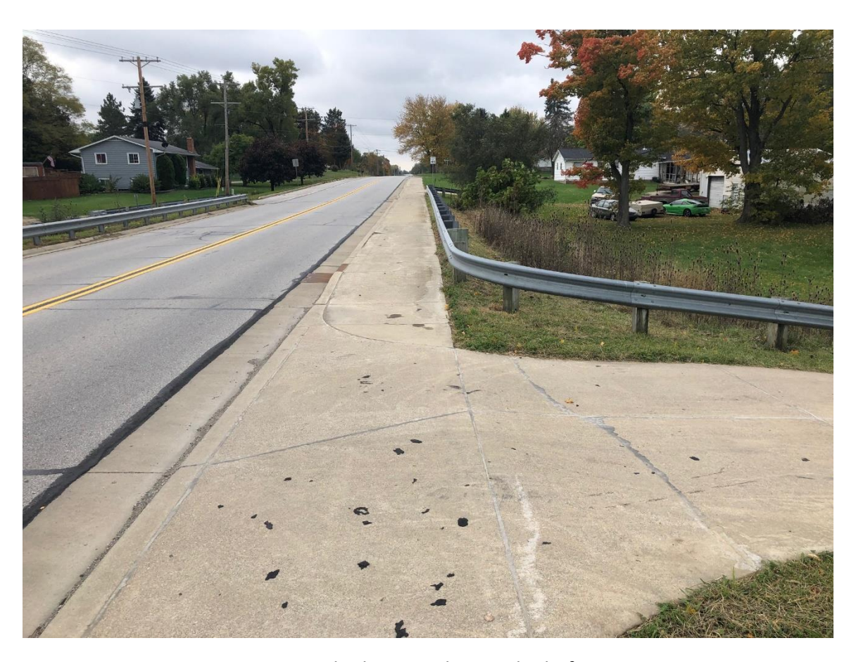
CR 1000 East looking south at Bodenhafer Drive