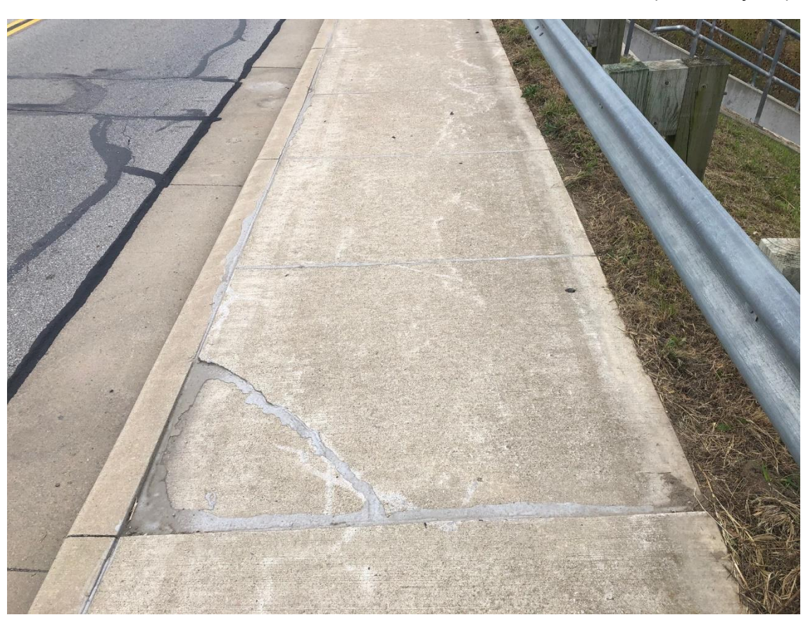
Patching / Minor Repair