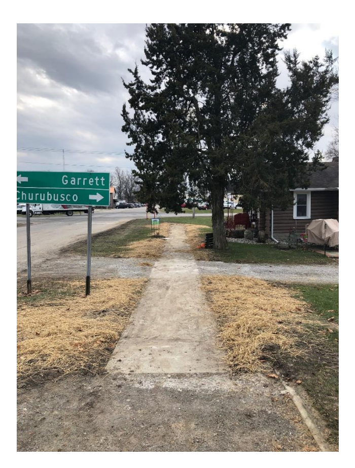
North of SR 205 looking South (Westside)