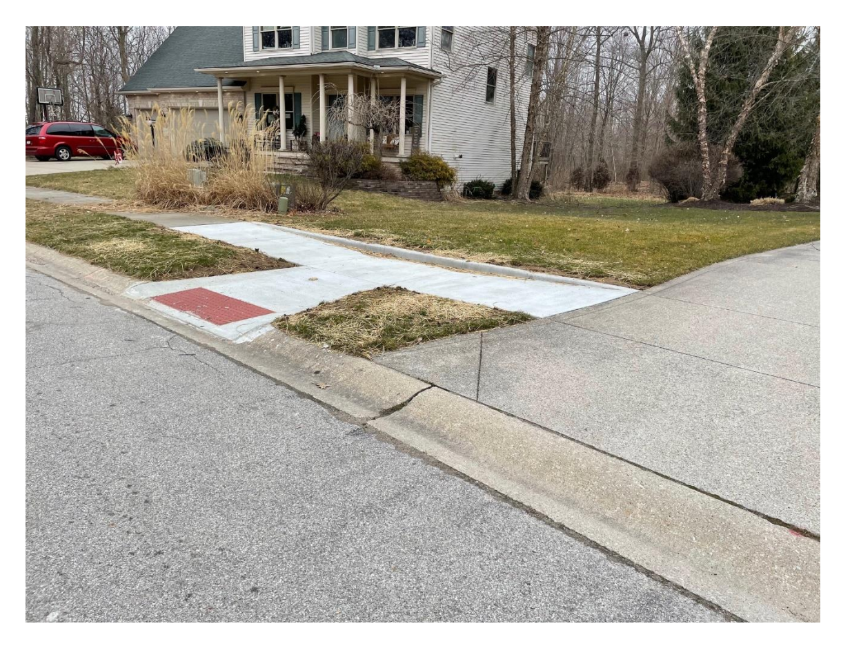
Ramp - 6C