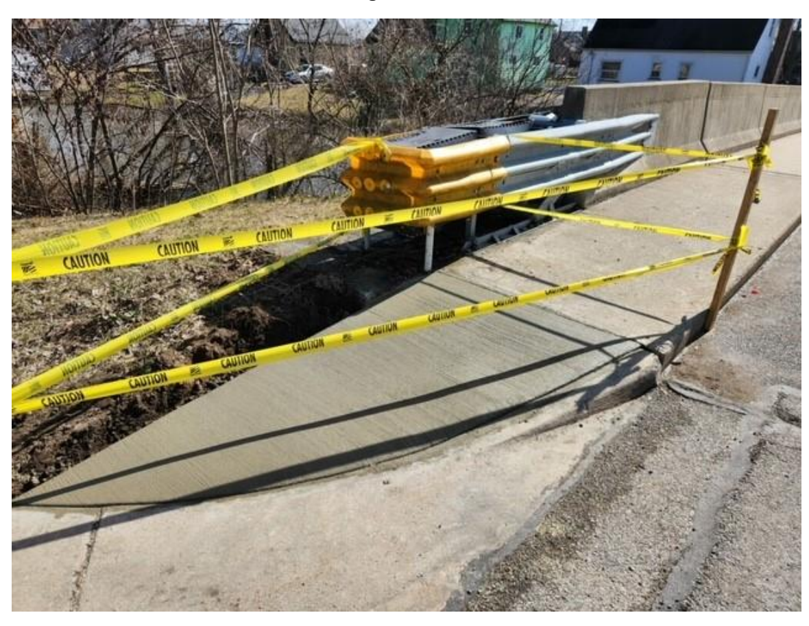
Bridge 1 - After