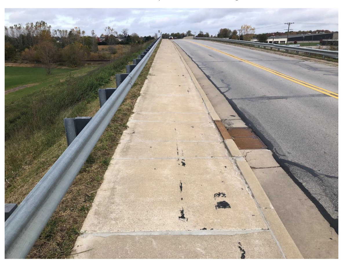
CR 1000 East looking north at Bridge 5