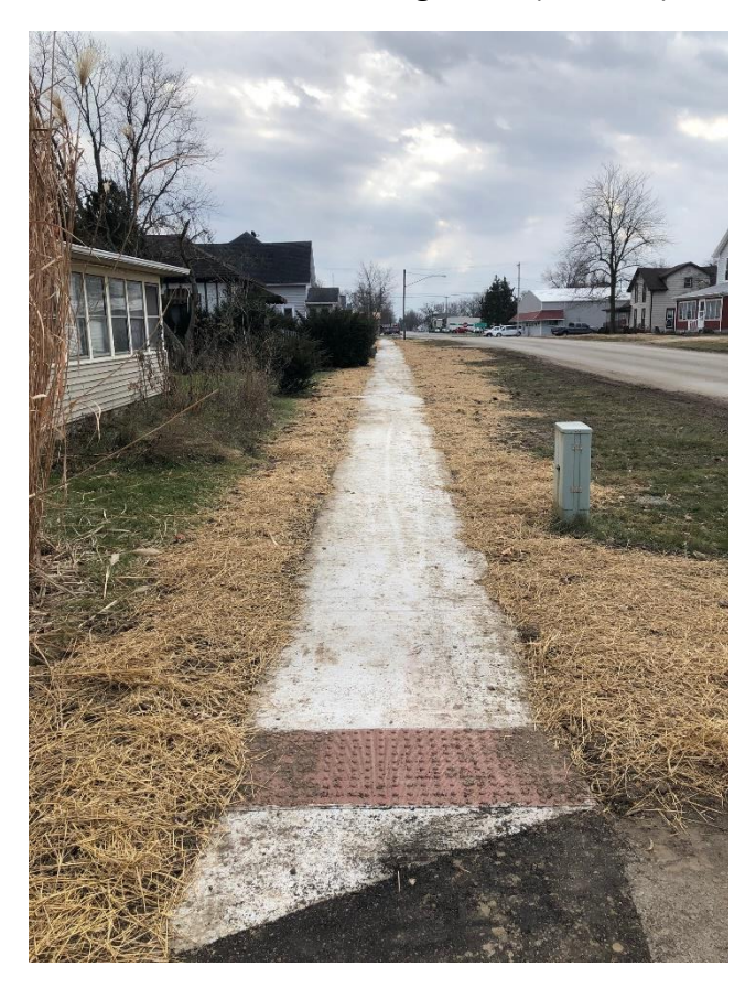
At Vorhees Street looking South (Eastside)