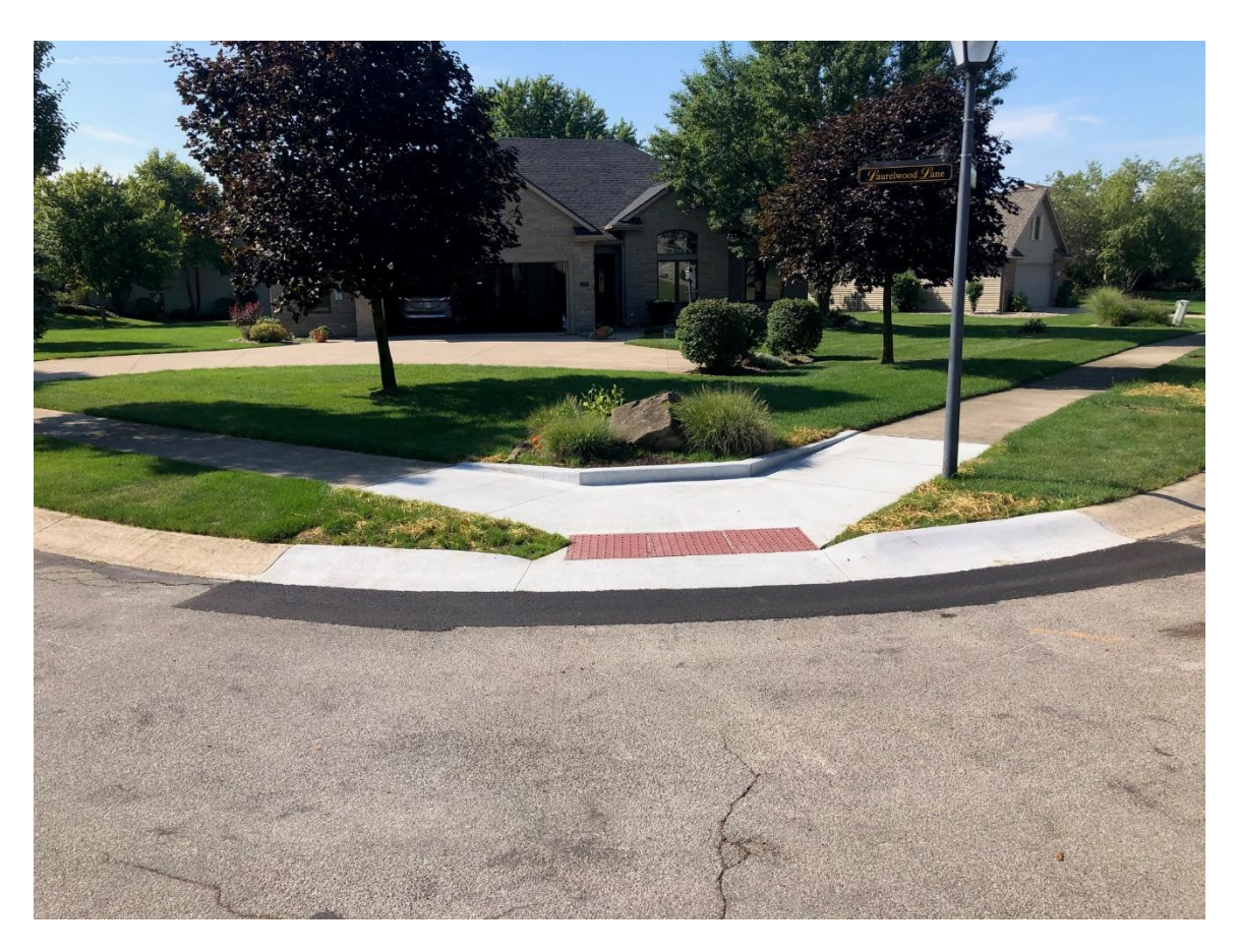
1A – Cobblestone Lane