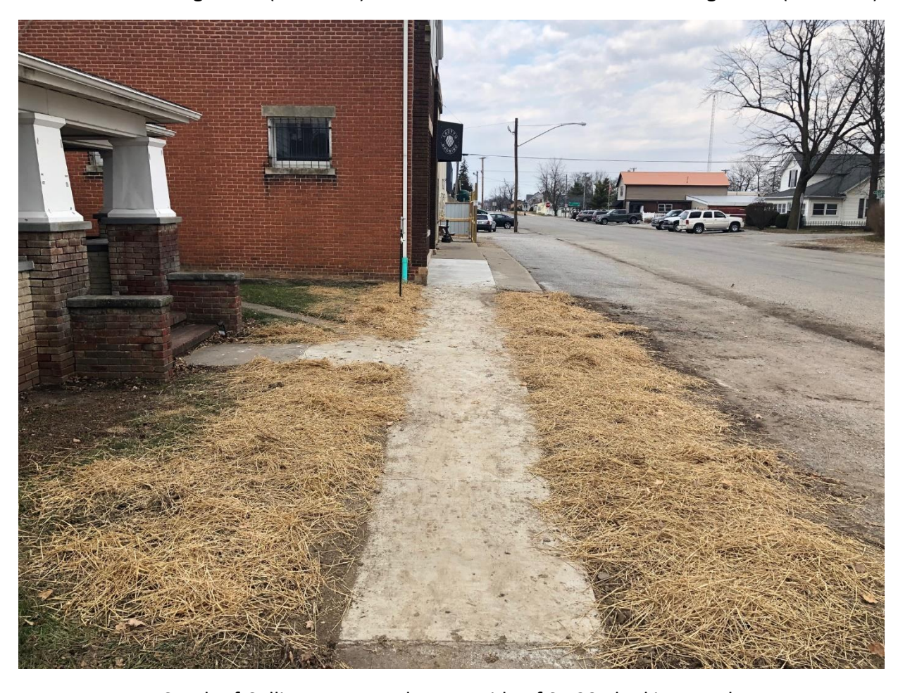
South of Collins street on the Westside of SR 205 looking North