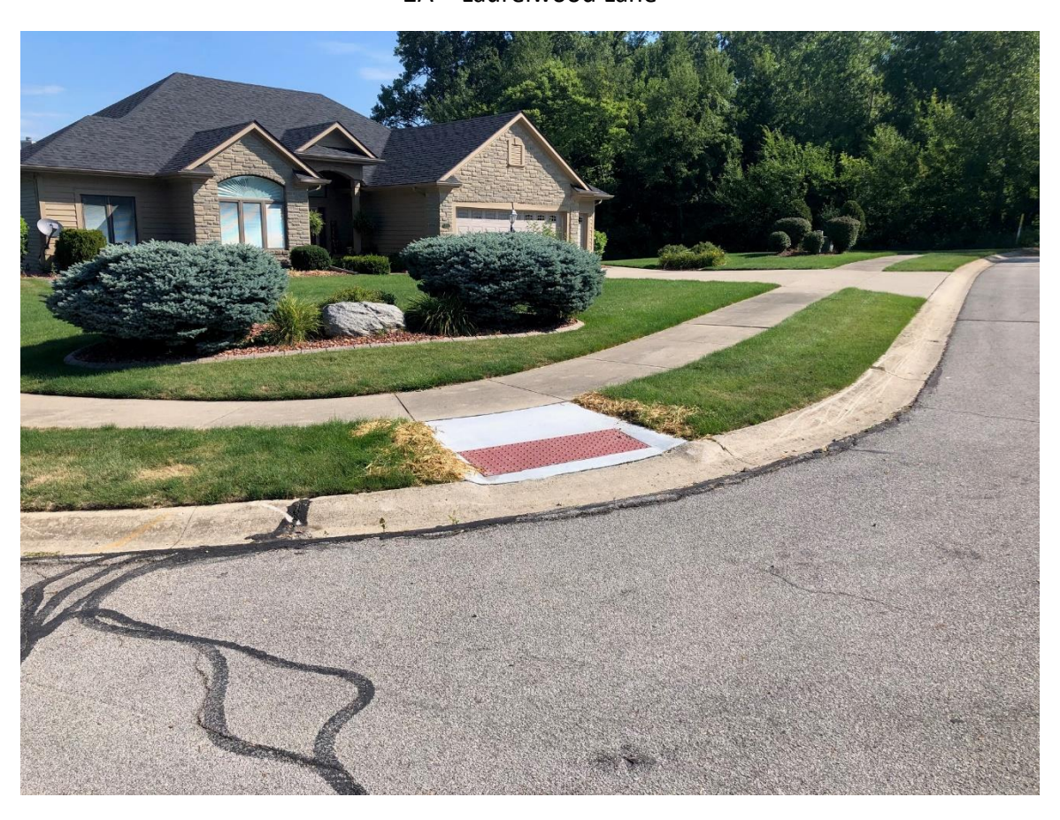
2B – Laurelwood Lane