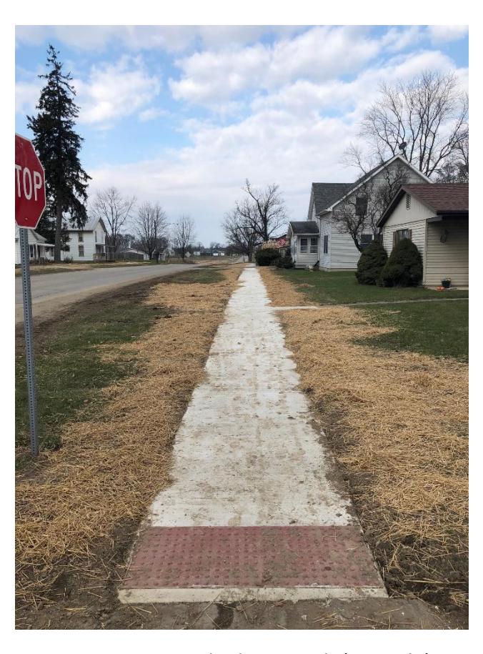
At Simon Street looking North (Eastside)