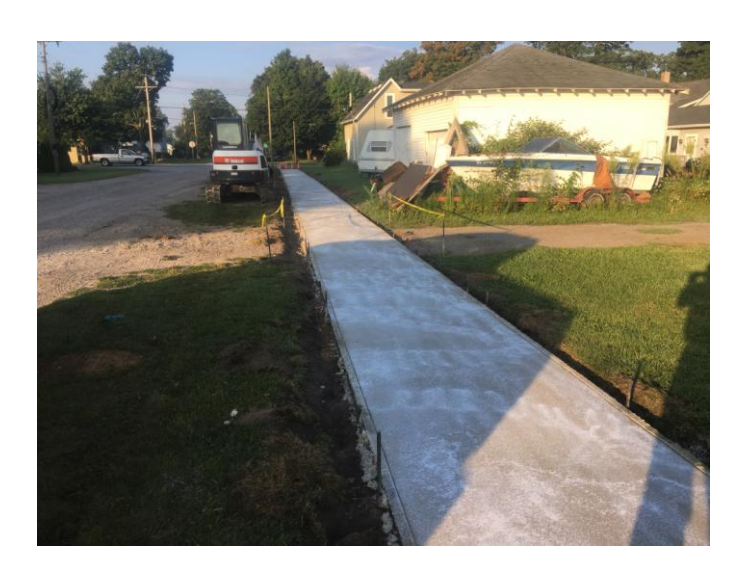
August the 16<sup>th</sup> day after concrete was poured.