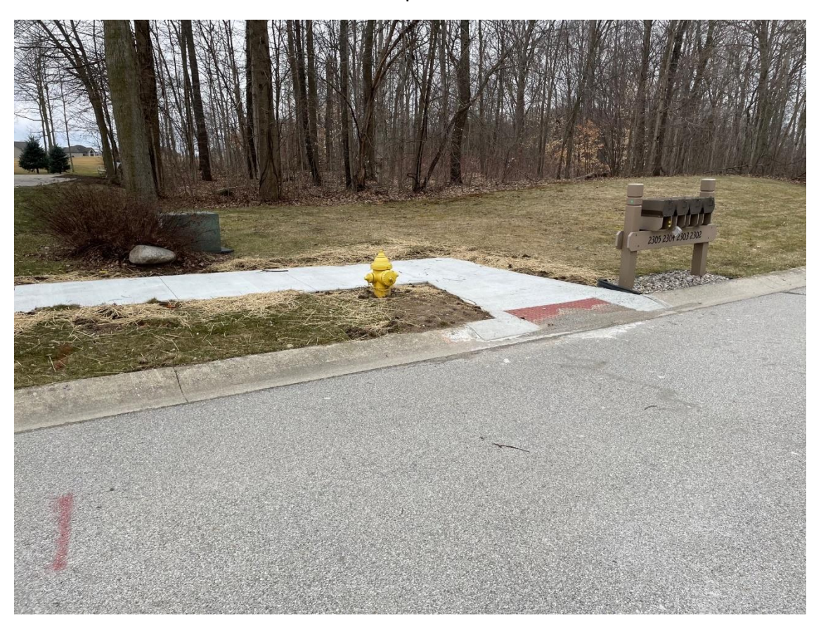
Ramp - 7A