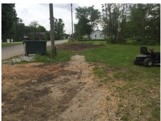
ADA Sidewalk, Wawaka 2016