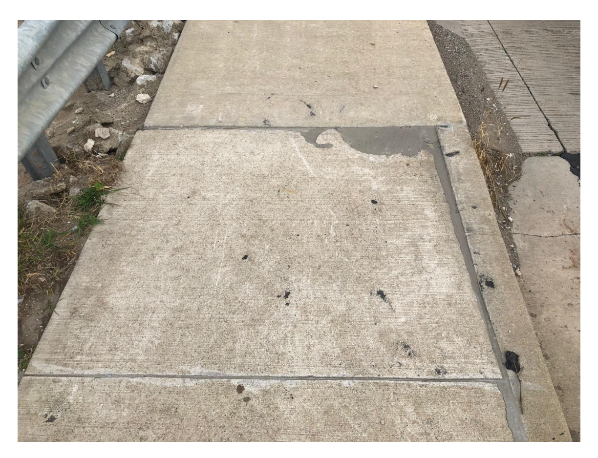
Repairs on Bridge 5 sidewalk