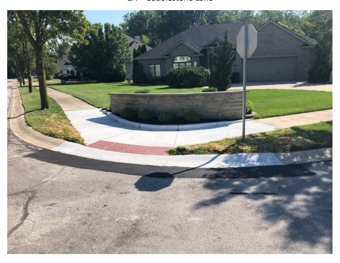
1B – Cobblestone Lane