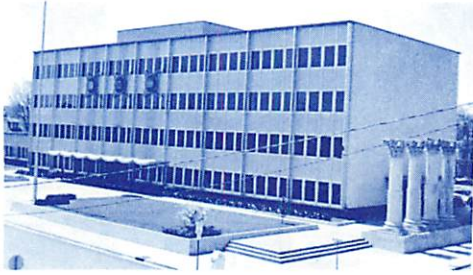
City-County Municipal Building