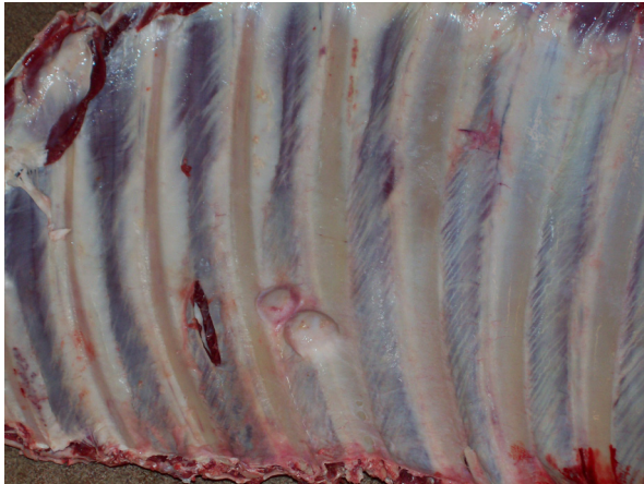
Pearl abscesses on inside lining of rib cage, may be as small as the tip of a finger