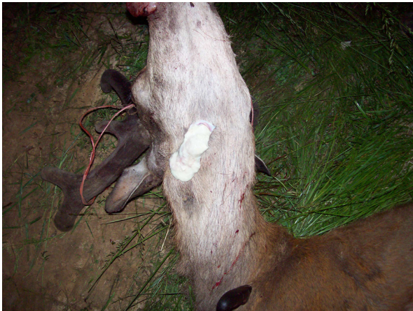
Abscessed lymph nodes in the neck. When ruptured, material is thick, yellowish or greenish without odor