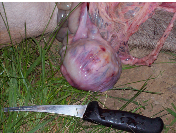
Large abscess within abdominal cavity may be large (grapefruit-sized) or very small