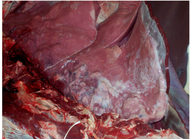
Lung lobes with chronic pneumonia and abscesses