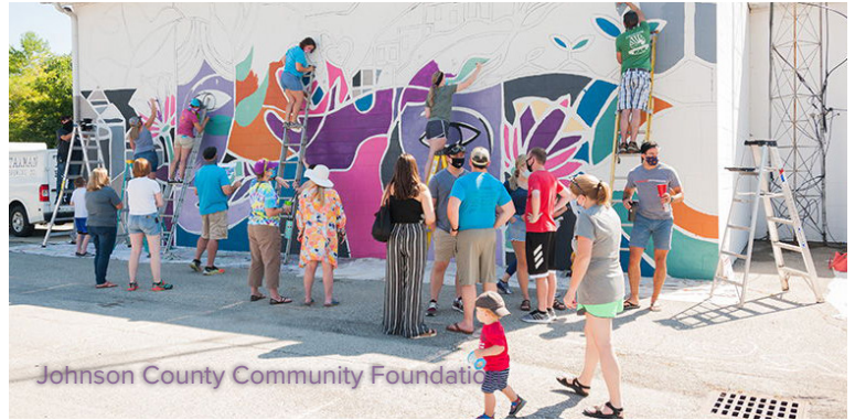
Johnson County Community Foundation