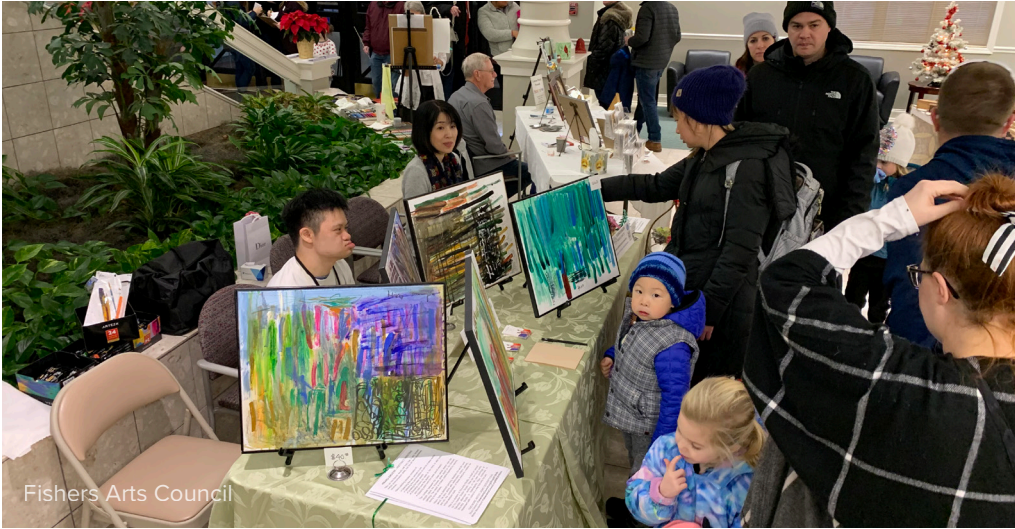
Fishers Arts Council

INDIANA ARTS COMMISSION MAKING THE ARTS HAPPEN