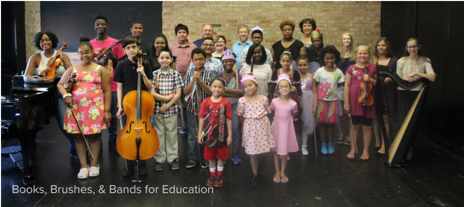
Books, Brushes, & Bands for Education

INDIANA ARTS COMMISSION MAKING THE ARTS HAPPEN