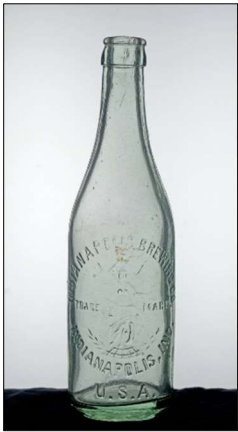
Embossed beer bottle from Indianapolis Brewing Company.

Brewing and distilling are long-standing traditions in America. Native Americans were known to have their own beer, and evidence of distilling has been found at Mount Vernon, home of George Washington, and Jamestown, one of the first European colonies in the Americas. What was once an alternative to drinking poor quality water has become a source of local pride and specialization in the modern era. As more new producers take up residence in historical buildings and utilize historical recipes, the modern world of Hoosier spirits is distinctly tied to our past.