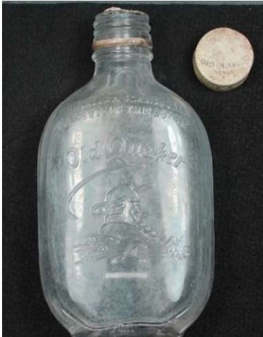
"Old Quaker" whiskey bottle recovered from 12-Mo-1083.

These companies are highlighted here because of their ties to Indiana history, applications to archaeology, and also their commitment to link modern products to the past. This list is by no means exhaustive, and we encourage you to check into local producers in your area for more selections!