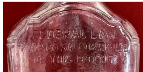
"FEDERAL LAW FORBIDS SALE OR RE-USE OF THIS BOTTLE." After the end of Prohibition, this text was required on all liquor bottles dating from 1935 through 1964.