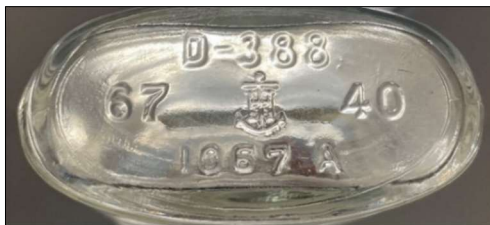
Some bottles have their manufacture and content information incorporated as part of their design. This glass bottle base shows a distiller number ("D-388") and bottle maker (the H-and-anchor motif represents the Anchor-Hocking Glass Company) as well as other identifying information. In this case, the markings tell us the bottle once held whiskey and most likely dates to c. 1940.