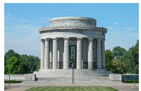
The memorial in Vincennes to George Rogers Clark and the Fall of Fort Sackville. Documenting the current level of preservation of commemorative properties such as this was an important part of this project.