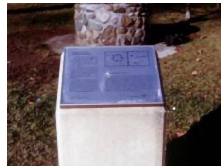
Assessing current conditions of fort locations was part of the process. This marker commemorates the second Fort Wayne.