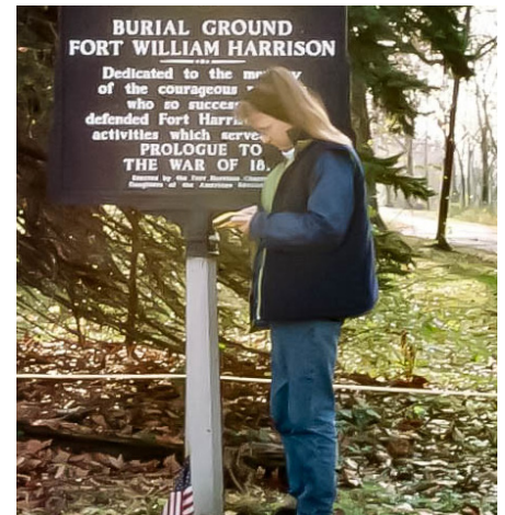
DHPA staff member using GPS technology to record a location related to Fort Harrison in Vigo County.