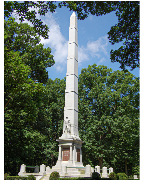
The Tippecanoe Battlefield in Indiana is so significant that it is a National Historic Landmark.

Extensive research was completed for each of the Indiana sites which had been chosen. The researchers drew upon records and primary sources available at the state level, and particularly at the local level. Contacts were made with, for example, local historical societies, libraries, local governmental offices (such as surveyors) and landowners, with the goal of finding as much information as possible for the individual historic properties. Items such as historic (and modern)