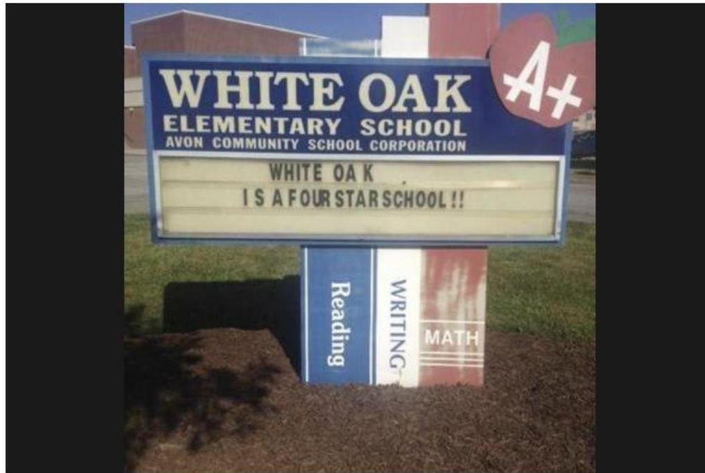
WHITE OAK: According to the report, the school corporation discovered a discrepancy in White Oak's bank accounts after an internal audit. From 2011 to '17, the discrepancies totaled just more than $89,000.

By Ashton Brellenthin ashton.brellenthin@flyergroup.com Feb 8, 2018