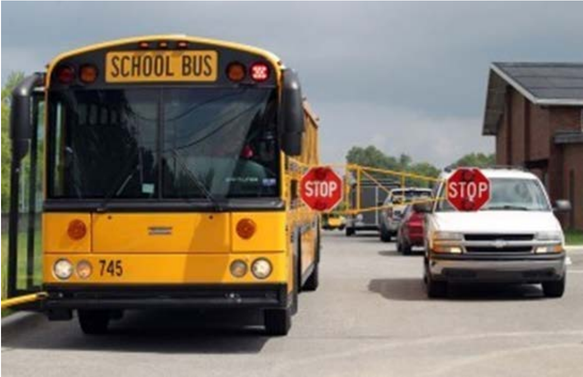
Figure 8. Extended stop arm with two stop signs on school bus.

To address motorists' failures to stop for school buses, extended stop arms have been designed to better communicate to oncoming drivers their responsibility to stop. Figures 8 and 9 show examples of extended stop arm systems. Pilot programs using extended stop arms have shown decreases in vehicles illegally passing stopped school buses. 66