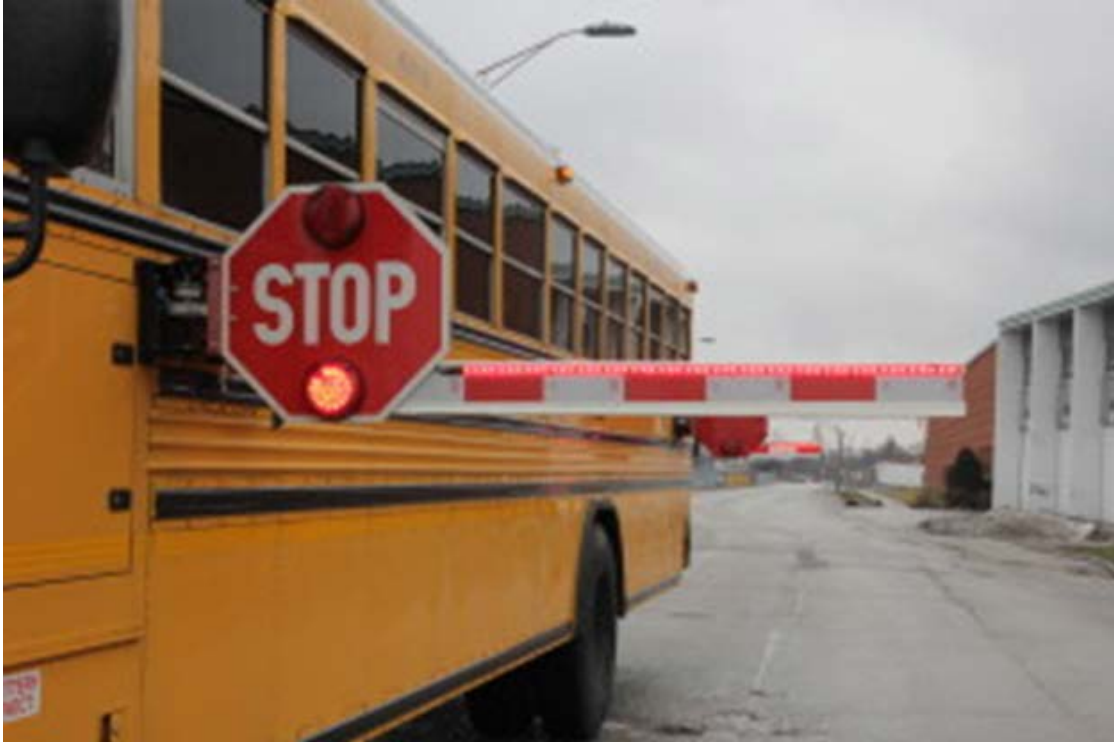
Figure 9. Close-up view of extended stop arm with single stop sign and horizontal stop bar.

Another new technology is the predictive stop arm. This safety feature uses radar technology and predictive analysis to monitor traffic approaching the school bus from either direction to assess the likelihood of illegal passings. 67 Each oncoming vehicle's speed, location, and acceleration/deceleration are used to determine whether the vehicle is likely to stop. When a risk is detected, the predictive stop arm provides an audible warning to the students and the bus driver.