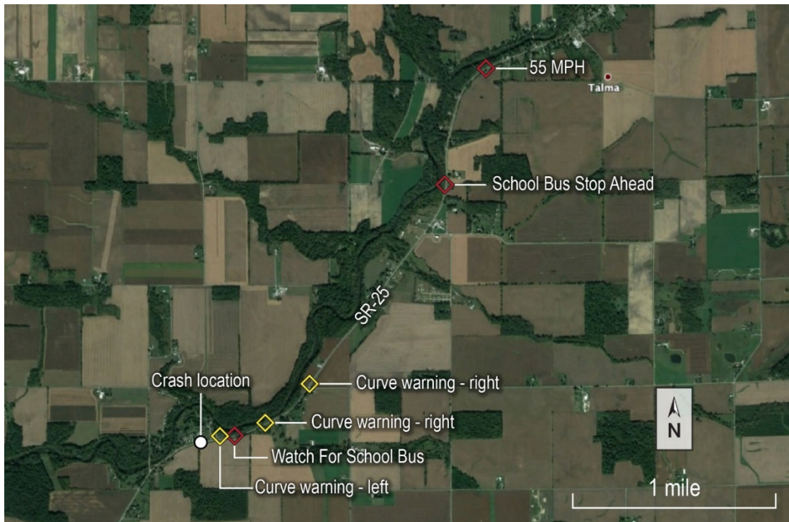
Figure 3. Southbound approach to collision site and relative locations of signage along SR-25.

With respect to highway signage, a Watch For School Bus sign is positioned about 868 feet north of the collision site. A School Bus Stop Ahead sign is positioned 9,706 feet north of the collision site. Curve warning signs are located 667 feet north of the collision site (left curve warning sign), 1,747 feet north of the collision site (right curve warning sign), and 3,355 feet north of the collision site (right curve warning sign). (See figure 3 for roadway and signage information.)