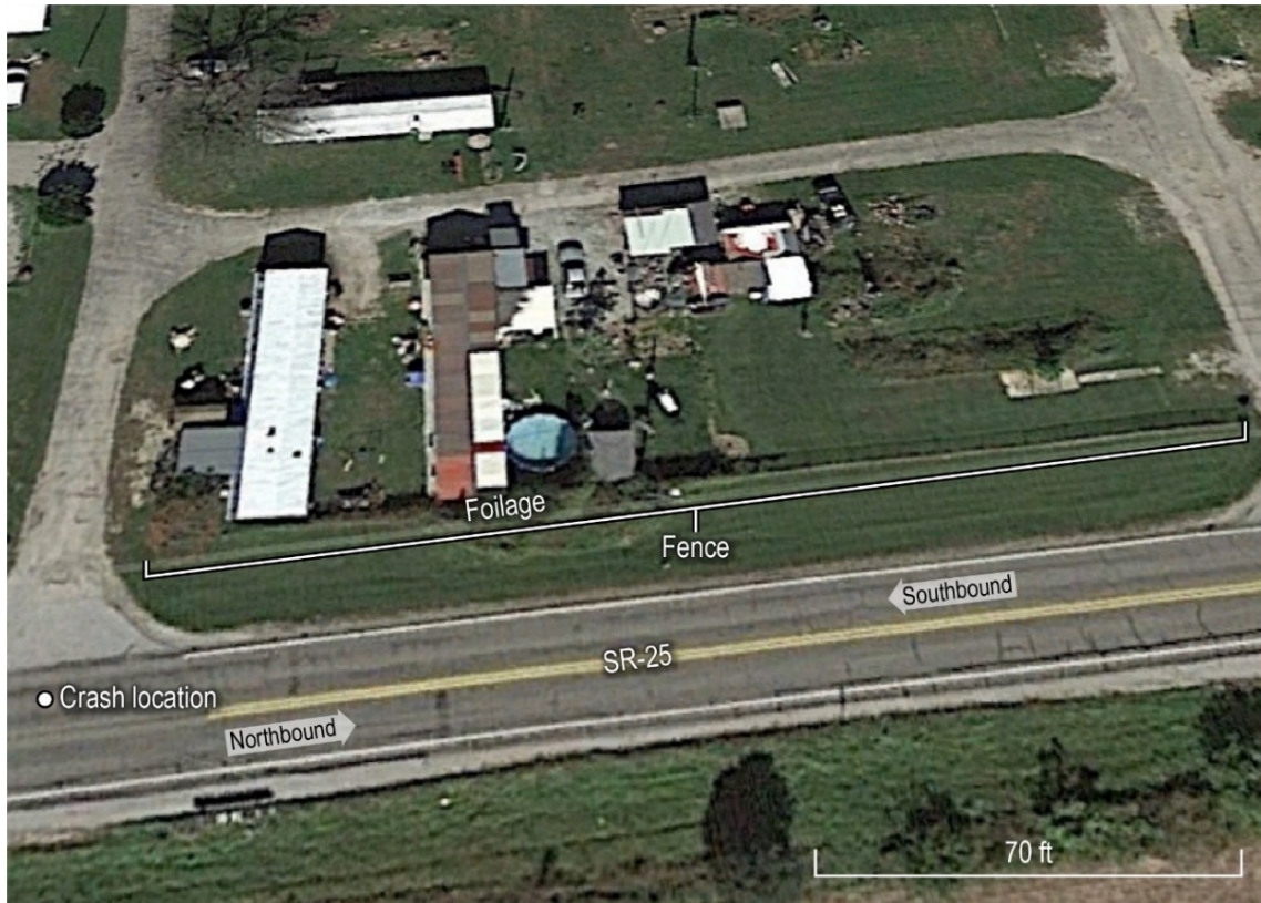
Figure 4. Crash location and SR-25 roadway.