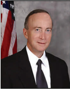
Mitchell E. Daniels, Jr. Governor, State of Indiana

“Our underground coal mines provide great benefits to this state. Coal mining plays an intricate role in economic stability, by providing jobs for Hoosiers and resources for consumption. I am committed to ensuring that Indiana miners are working in safe conditions. The Bureau of Mines, a division of the Indiana Department of Labor has made great strides in ensuring Hoosier mine safety, but there is more work to be done. We will always be striving to provide a better and safer future for our Hoosier workers.”