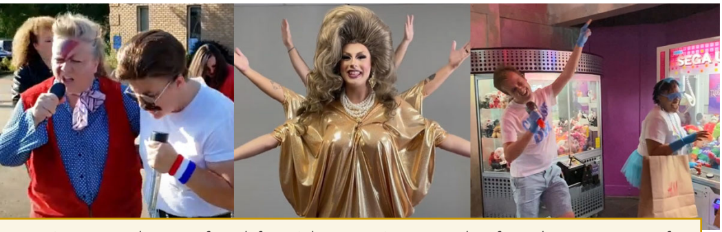
Lip Sync Battle teams from left to right: Returning contenders from the Department of Child Services - Warrick County, first-time contenders from the Indiana Department of Health, and returning champs from the Department of Financial Institutions.