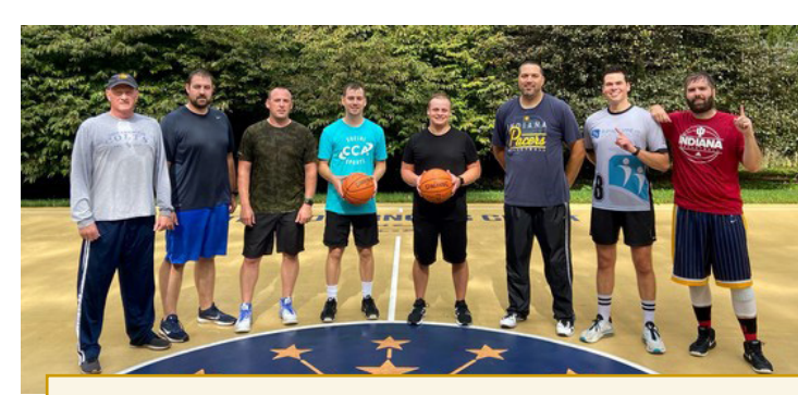
The team from DNR (left) and the team from IURC (right) pose for a photo after the SECC Basketball Relay. IURC defeated DNR 200 to 187 in the championship round.

SECC competitors returned to the Governor's Residence in Week 7 to take part in the Basketball Relay. This was the second year for the popular event, which allows teams to pit their basketball shooting skills against one another by seeing who can shoot the most shots from specific points on the court in 10 minutes. It's not as easy as it sounds, but the teams were extremely competitive. The team from the Indiana Utility Regulatory Commission (IURC) defeated the team from the Department of Natural Resources (DNR) in the final round with a score of 200 to 187.