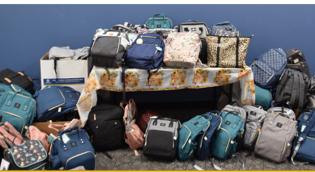
Judges at the Indiana Court of Appeals coordinated a diaper bag drive for Afghan refugees. State of Indiana employees donated more than 145 bags filled with items to give every mom a fresh start.

That's why the judges at the Indiana Court of Appeals decided that every expectant mother at Atterbury was going to be provided a diaper bag as a way to show Hoosier hospitality