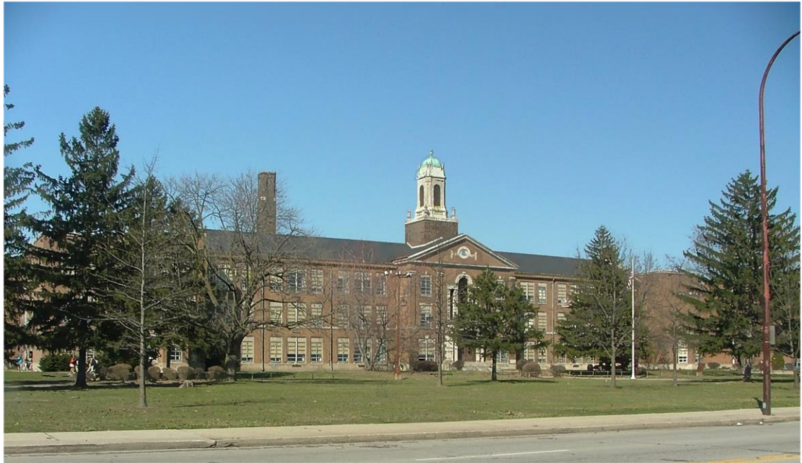
NATIONAL REGISTRY OF HISTORIC PLACES, GALLERY OF ASSETS, THEODORE ROOSEVELT HIGH SCHOOL