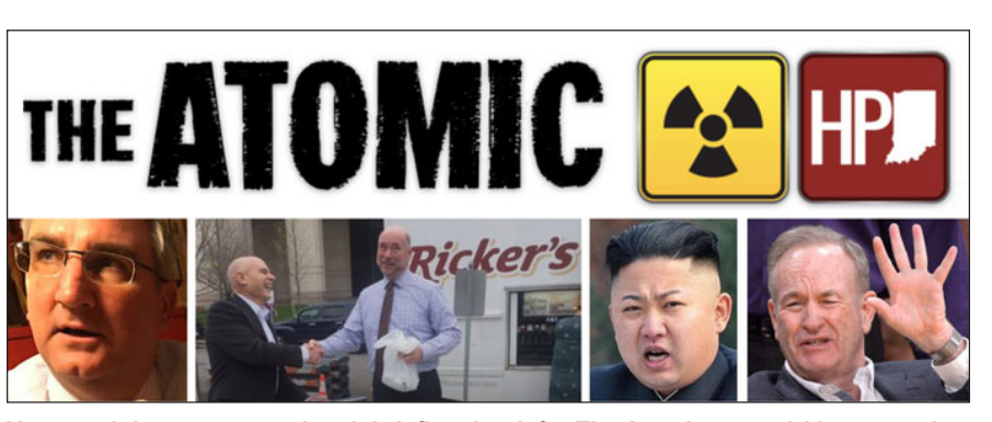
Your weekday pre- power lunch briefing. Look for The Atomic around 11 a.m. week-

In lock step with the budget lies the HB1002 road infrastructure bill. A major milestone was reached in the state Senate Tuesday as the bill passed 34-13; but changes in joint conference committee seem inevitable. HB1002 has dominated discussions at the Statehouse and next to the budget is the most important bill of the session. An initiative supported by Gov. Holcomb, HB1002 calls for increasing the gas tax and creates a number of fees to pay for infrastructure investments over the coming decades. Experts estimated late last year that Indiana will need to invest an average of $1.2 billion in roads each year over the next 20 years to tackle the state's crippling