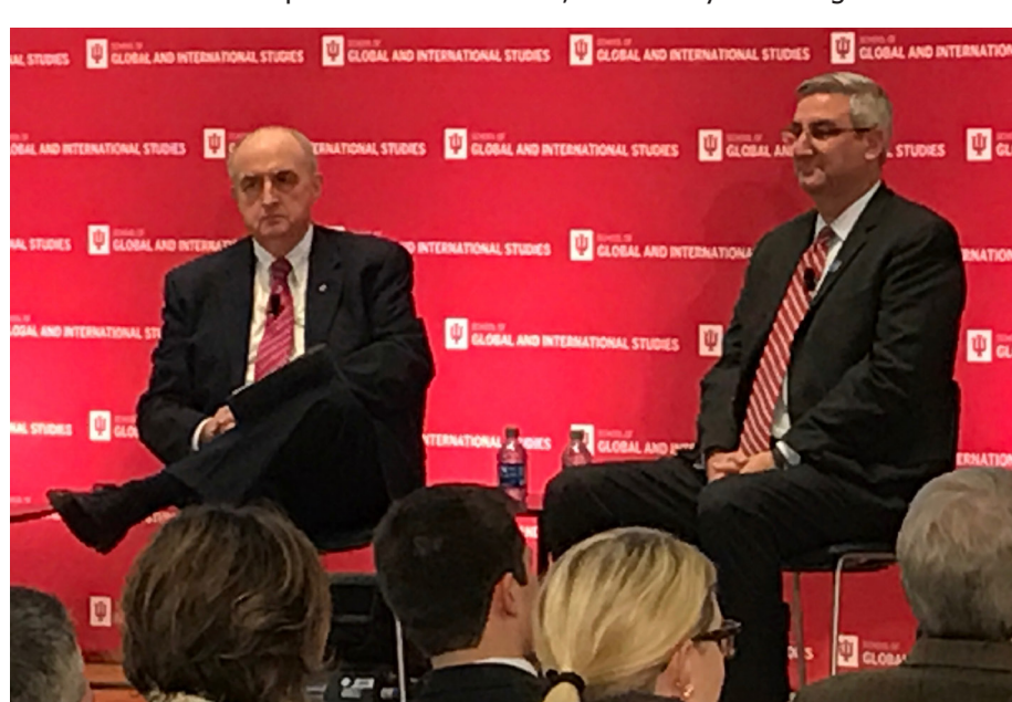
globalization and trade?

McRobbie: When you look at Indiana, you have manufacturing and agricultural which rely very much on exports. In that context, what are your thoughts about