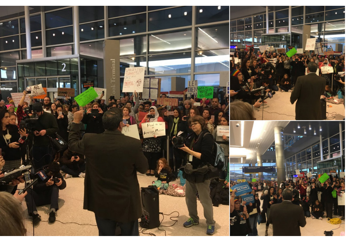
nominations, including to the Supreme Court," Don-signed the immigration ban order.

As for the 2018 Senate race, Brooks, R-Carmel,