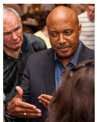
Attorney General Curtis Hill during the Republican Convention.