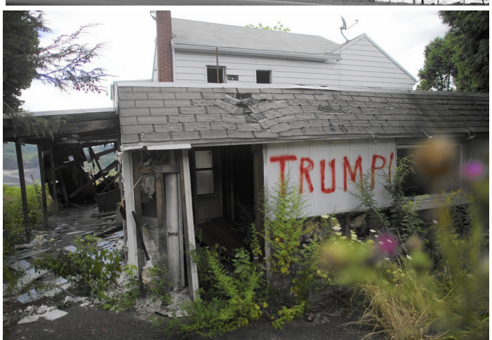
Rust Belt and Appalachian scenes from Pennyslvania and Middleton, Ohio.

than $100 million in small donations, is not beholden to super PACs and special interests, and is promising a 'revolution' that the broader public appears to be embracing. The $7 billion in profits by United Technologies, and its move to Mexico to save $65 million while abandoning a city it called home for six decades, has become the poster for middle class angst. Sanders conjures notions of $100 million golden parachutes for departing executives, and an extreme bent for shareholder profits over any scraps for the middle and lower classes that resonates in a different prism than the one Trump presents."