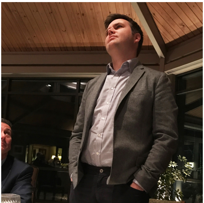
J.D. Vance listens to a question at the Purdue presidential residence of Westwood on Monday night.