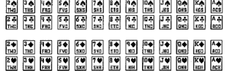
Tables 1 – 4 COMMUNITY CARDS Play Symbols: