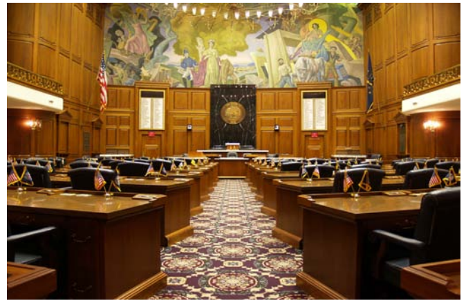
The chamber of the Indiana House of Representatives

Interns work alongside the members and staff of the House of Representatives and will have office space in the Statehouse in downtown Indianapolis.