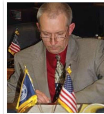
Rep. Thompson studies legislation.