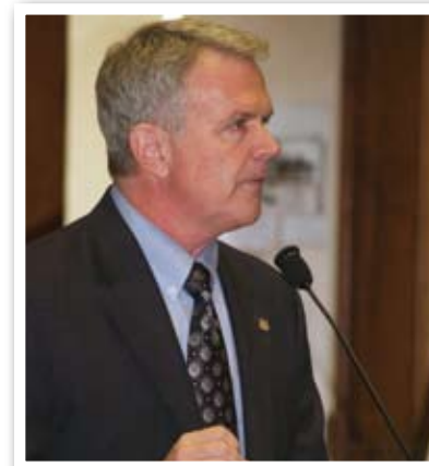
Rep. Steuerwald makes a point during debate in the House of Representatives.