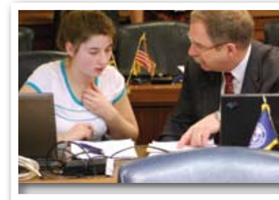
Rep. Leonard talking with a page.