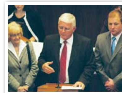
Rep. Lehe speaks before the House on a resolution celebrating the City of Monticello's 100th anniversary.