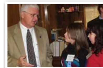
Rep. Lehe talks with legislative pages on the House floor. To find out how you can serve as a page, visit: http://tinyurl.com/HousePage