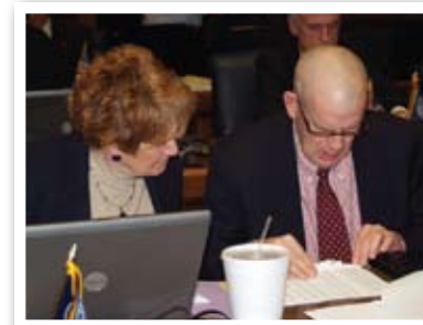
Rep. Clements discussing legislation with Rep. Doug Gutwein.