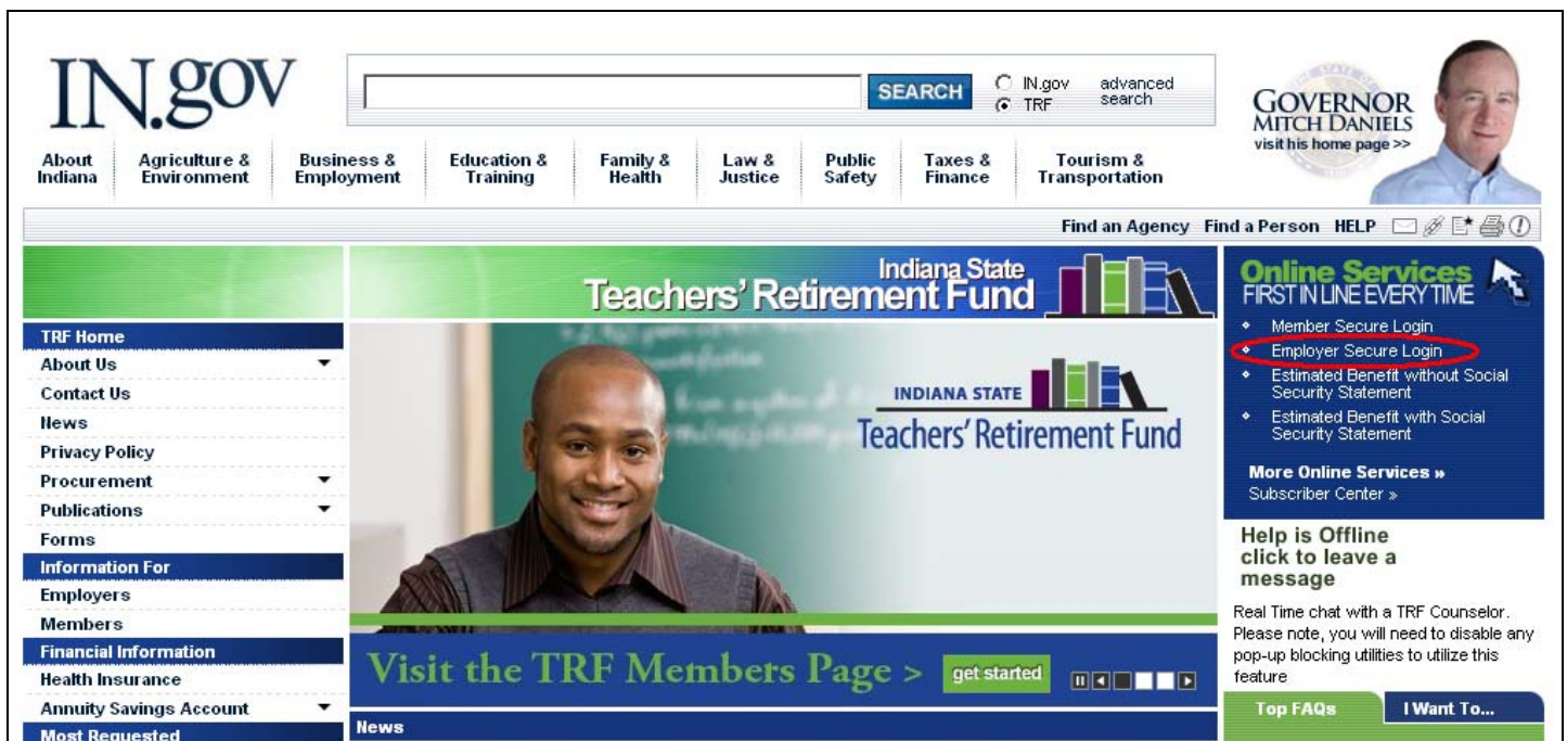
Figure 1 – Indiana State Teachers' Retirement Fund Home Page

Note: Consider bookmarking the Login Page for quicker access in the future.