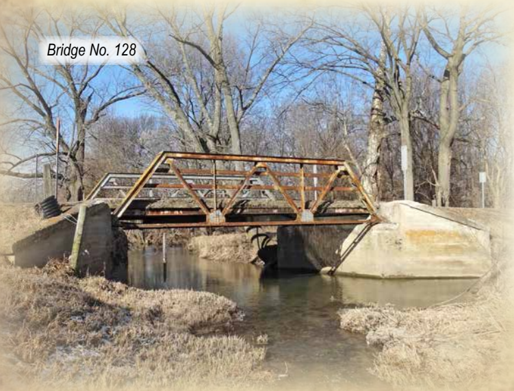
Bridge No. 128

FHWA, the Indiana State Historic Preservation Officer (SHPO) and the Indiana Department of Transportation (INDOT), this brochure was created to help mitigate the adverse effect of the replacement of the historic concrete arch bridge that once carried State Road 9 over Lewis Creek in Shelby County (pictured above).