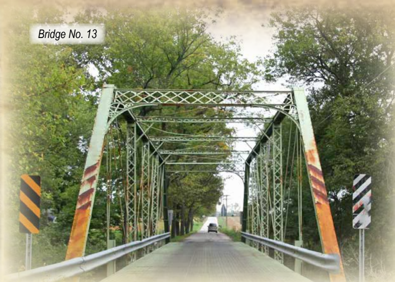
Bridge No. 13