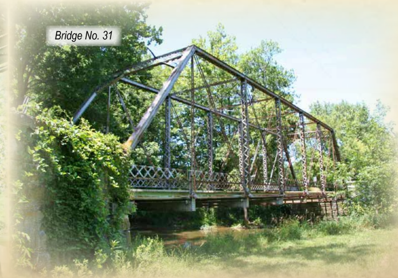
Bridge No. 31