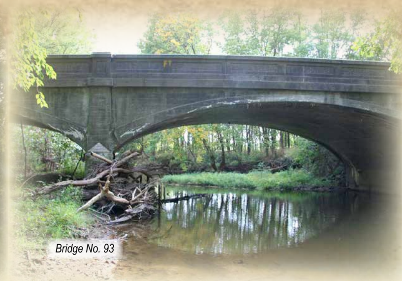
Bridge No. 93