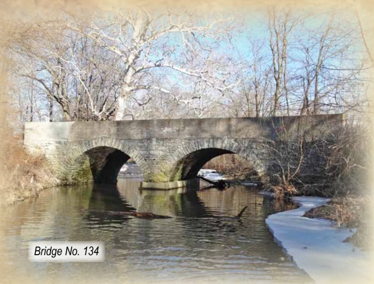
Bridge No. 134