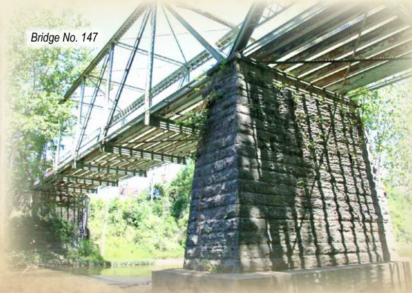
Bridge No. 147