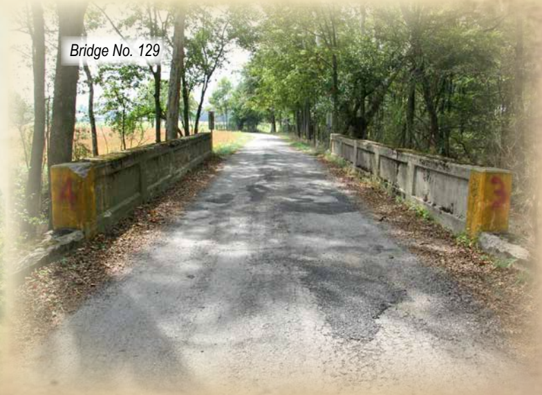
Bridge No. 129