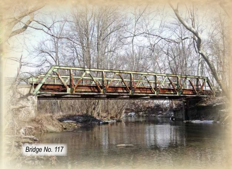
Bridge No. 117

All of the bridges featured in this brochure have been determined to be eligible for listing in the National Register of Historic Places.