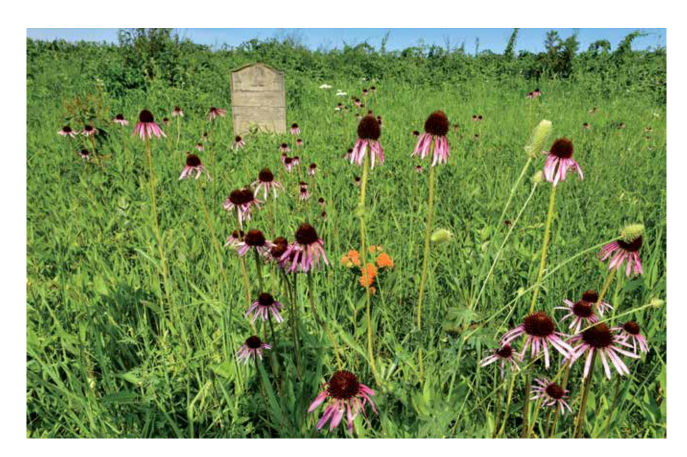
(Above) In 1997, Smith Cemetery near Perrysville was dedicated as a state nature preserve. There are more than 30 species of prairie plants throughout the pioneer cemetery. (Below) The Monastery Immaculate Conception and its cemetery of iron crosses is in Ferdinand. The monastery is home to one of the largest communities of Benedictine women in the United States. (Opposite page) DNR workers spray for invasive species at Smith Cemetery Nature Preserve.