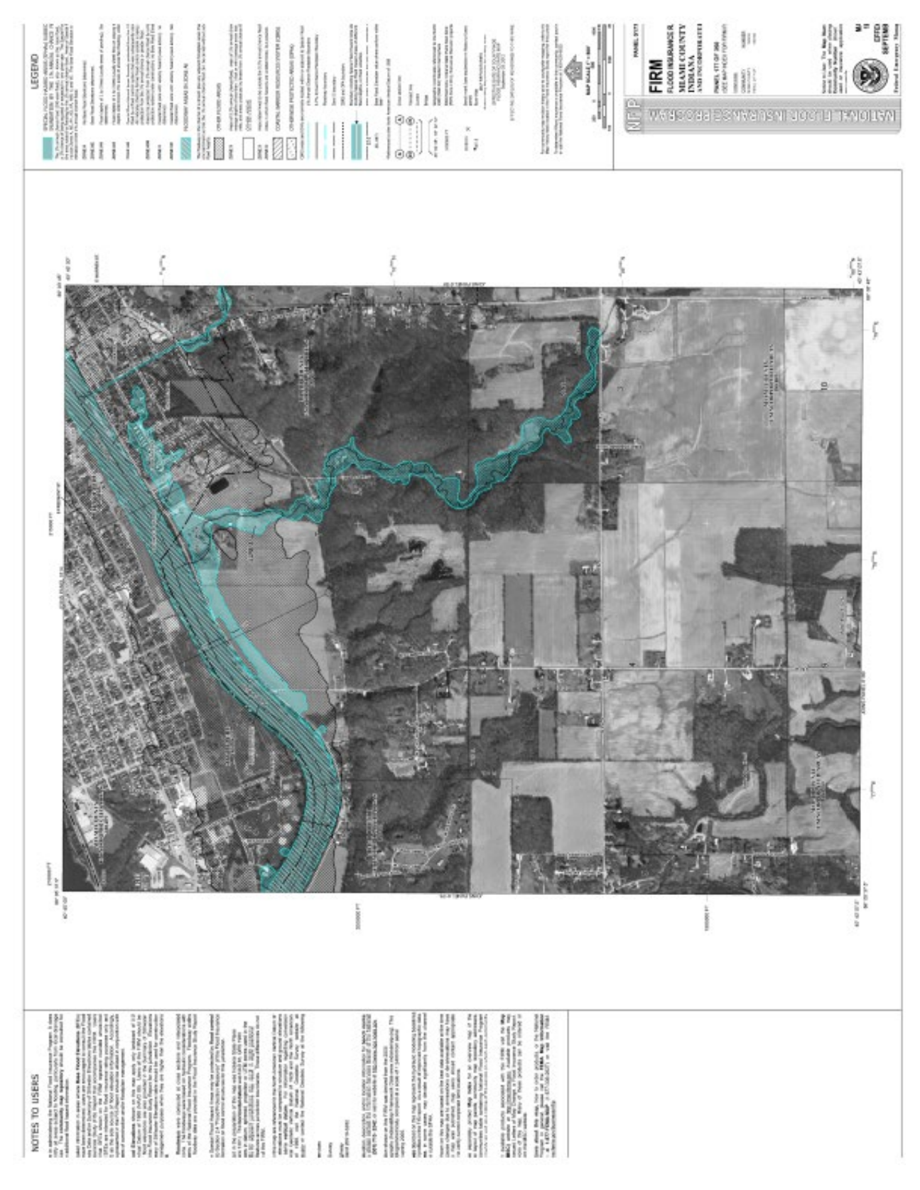
Figure 2 – Floodplain Map