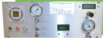
Air toxics monitor