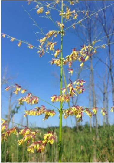
Wild Rice ( Zizania aquatica ).