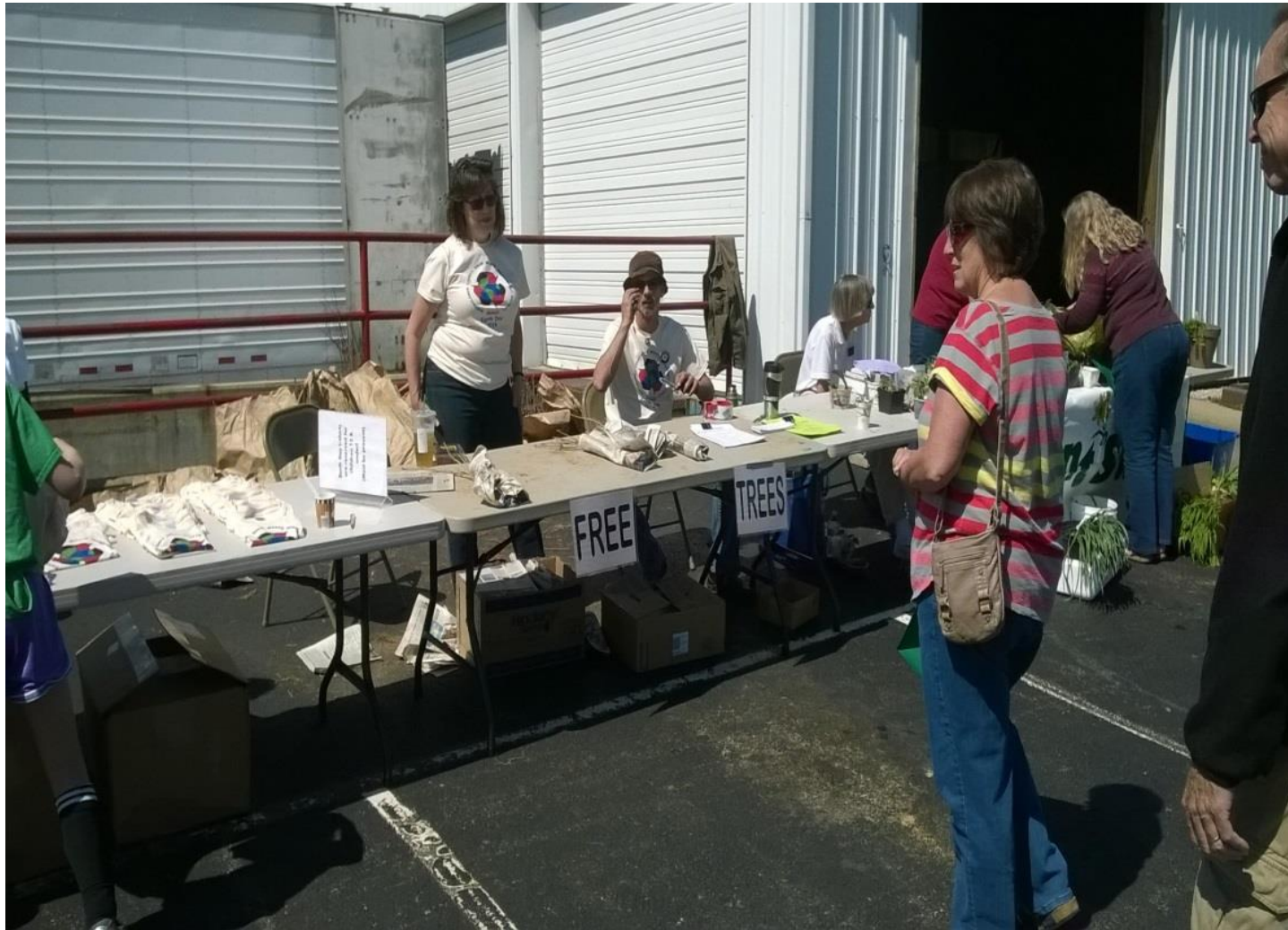
Bartholomew County Recycling Center – Earth Day Celebration, April 26, 2014