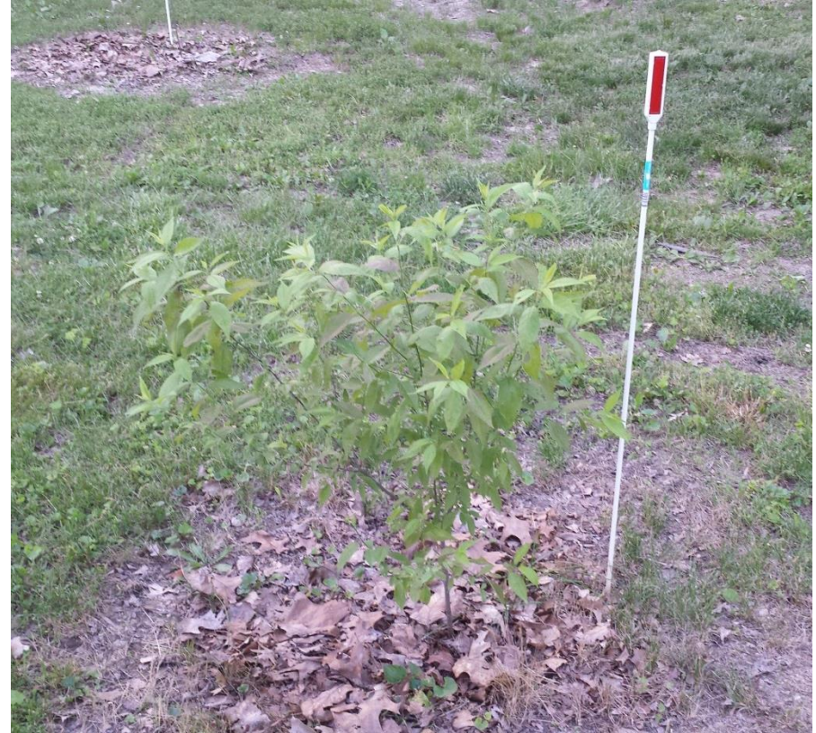
American Plums from 2 different counties