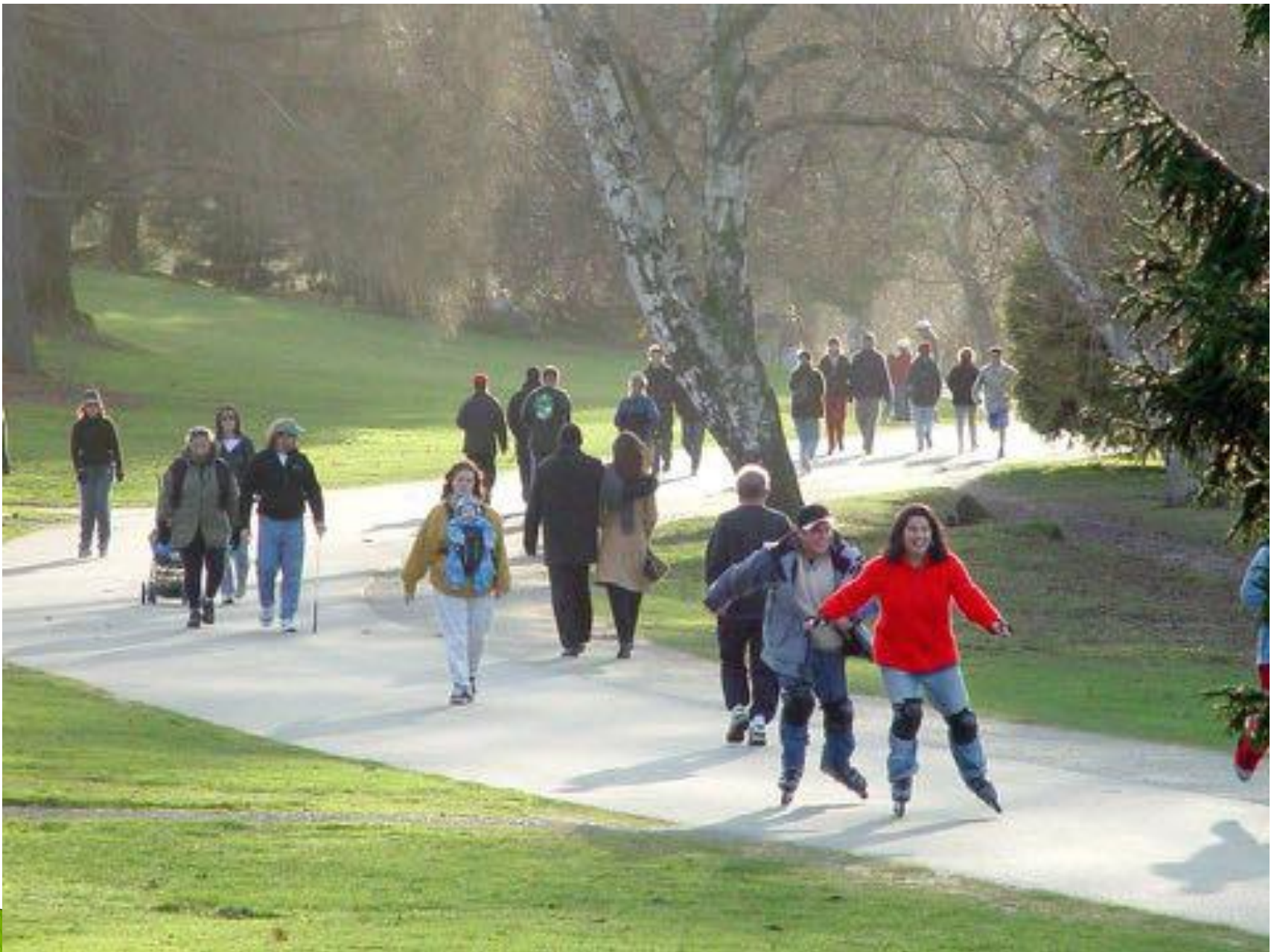
2015 July WTMS Summer Workshop Kwolf.pdf