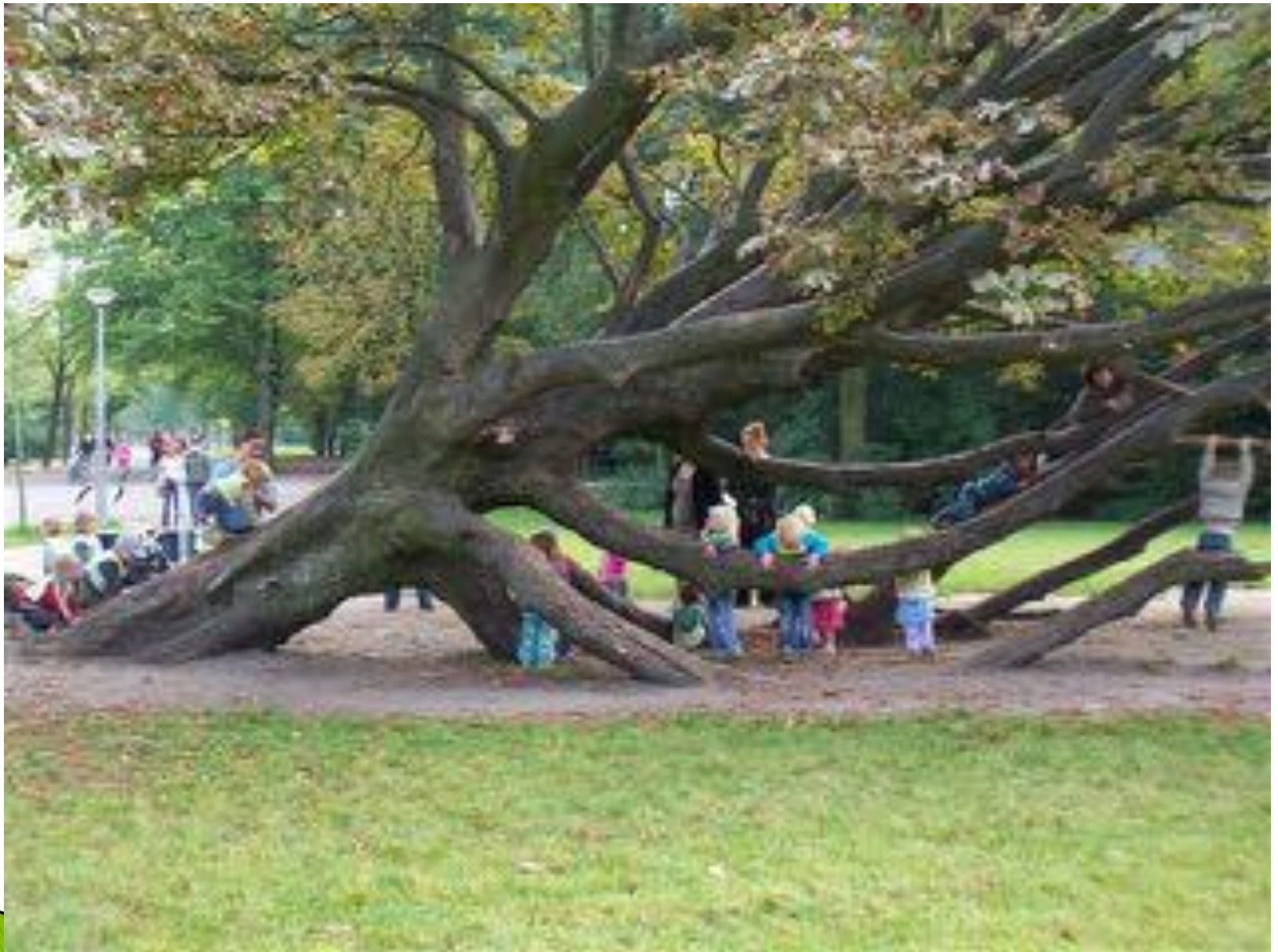
2015 July WTMS Summer Workshop Kwolf.pdf