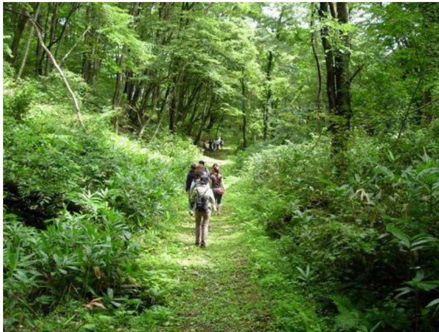
2015 July WTMS Summer Workshop Kwolf.pdf