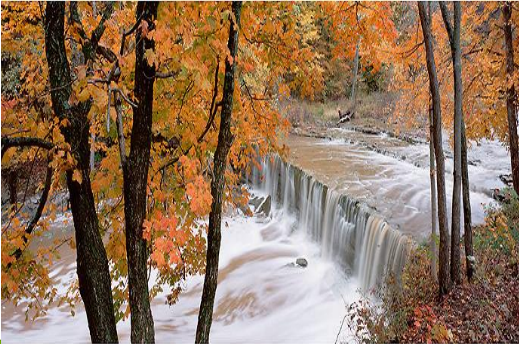
► Anderson Falls, Bartholomew County, Indiana